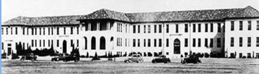
Austin Hall, Air Corps Tactical School, 1931, now Headquarters Air University

they developed the basic concepts of high altitude, daylight precision bombing of industrial targets that became the basis for the strategic bombing of Germany and Japan during World War II.