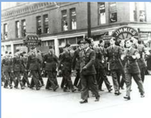
RAF cadets from Maxwell in Armistice Day parade, Montgomery AL, Nov 1941

In 1941, further plans called for an expansion of the flying training mission. As a result, the Air Corps established an advanced flying school at Maxwell and a basic school at Montgomery's Municipal Airport. The Air Corps quickly obtained rights to the airport and renamed it Gunter Field to honor the recently deceased mayor of Montgomery, William A. Gunter. By the end of the war, these schools graduated more than 100,000 aviation cadets.