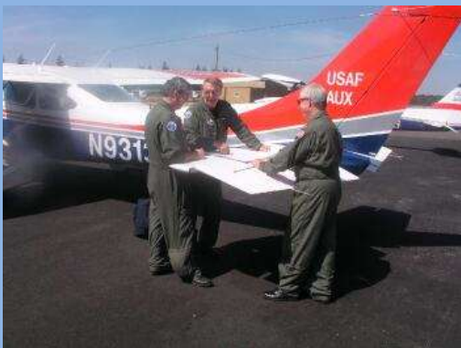
Planning a Civil Air Patrol Mission

During the 1970s, AU continued to grow. The Air Force established the Air Force Logistics Management Center (AFLMC) and assigned it to Air University on 1 October 1975. On that same day, the Leadership and Management Development Center (LMDC), HQ Civil Air Patrol-USAF, and the Air Force Judge Advocate General School joined the AU family. The following year, LMDC was merged with the AU Institute for Professional Development but retained its name.