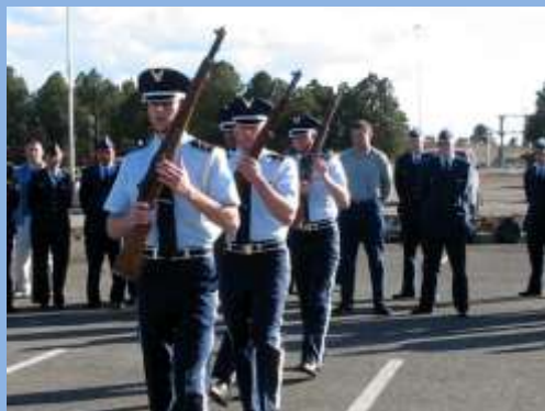
Air Force ROTC Unit Practicing Drills

The outbreak of the Korean War on 25 June 1950 interrupted AU’s growth and stability. Air Force commanders argued they needed the personnel attending AU for operational commitments and that the Air Force should close AU. However, Air Force leaders, rather than closing AU completely, decided to reduce its operations. As a result, the Air Force suspended the AWC and the Air Tactical School and reduced the length of the ACSS to less than four months.