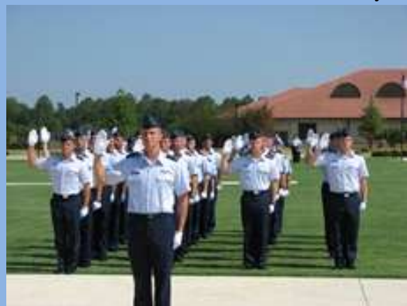
Commissioning Ceremony at Officer Training School

Starting in the late 1990s, AU pursued degree granting authority and accreditation. In December 1999, SAASS received its accreditation from the Southern Association of Colleges and Schools (SACS) to award a master’s degree. In 2000, the AU commander received authority to confer the Master of Strategic Studies degree to resident graduates of the AWC and the Master of Military Operational Art and Science degree to resident graduates of the ACSC. In 2001, SACS placed AU as an institution that offered graduate degrees on an equal basis with other accredited academic institutions. In 2008, the AU Commander established a program to award an honorary doctorate of letters or science to