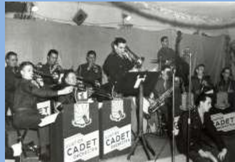
Capt Glen Miller, renowned prewar big band leader, served at Maxwell Field during Dec 1942 as a special services officer.