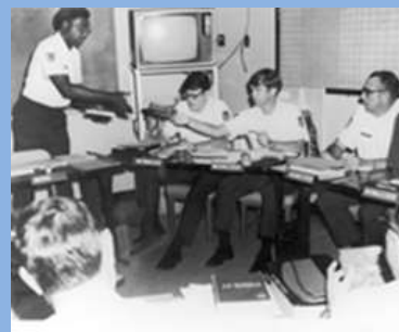
Air Force SNCO Academy Seminar at Gunter Annex

Secretary of the Air Force Donald B. Rice and the Chief of Staff of the Air Force General Merrill A. McPeak created a vision of an Air Force office that would inculcate the principles of total quality management across the Air Force. This concept, later known as the Quality Air Force (QAF), led to the establishment of the Air Force Quality Center on 1 August 1991 under AU at Maxwell. The center provided the Air Force with the concepts, methods, tools, and advice to aid them in attaining a QAF culture, as well as QAF education programs, consulting services, training resource materials, and related research and analysis services.