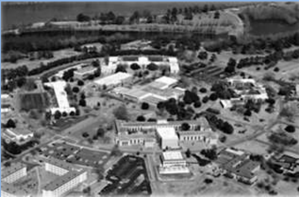
Chennault Circle in the 1970s with Air University Library in the Center

The Vietnam War era brought changes to the missions and activities at Air University. President John F. Kennedy requested that “various levels of instruction in counterinsurgency (COIN) be given to all military personnel.” As a result, the ACSC developed a two-week COIN course in 1962. By March 1963, AU transferred this course into the AU Warfare Systems School. As Air Force involvement in the Vietnam War grew in the 1960s, AU in 1968 saw a 30 percent reduction in ACSC and SOS attendance.