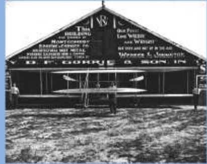
Wright Flying School Hanger and Maintenance Workshop, 1910

The history of Maxwell Air Force Base began with Orville and Wilbur Wright, who, wanting to take advantage of their 1903 historic flight, decided in early 1910 to open a flying school to teach civilians how to fly and to promote the sale of their airplane. Wilbur, after looking at locations in Florida, came to Montgomery, Alabama. After his initial visit in February, the Wright Brothers decided to open the nation's first civilian flying school on an old cotton plantation near Montgomery that subsequently became Maxwell Air Force Base (AFB). Unfortunately, the school closed after only a few months of operation.