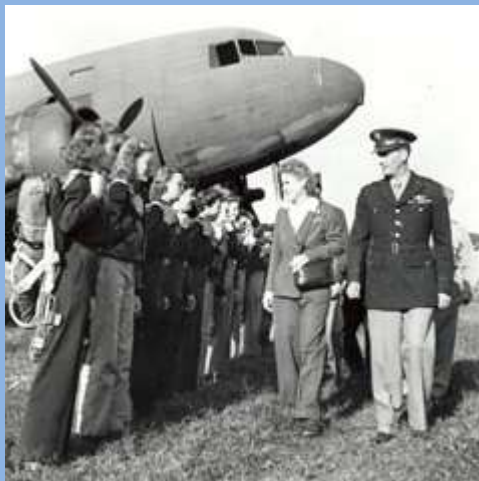
Jacqueline Cochran, Chief of the WASP, inspects women pilots at Maxwell

Maxwell Field, like other AAF installations, had its own segregated African American unit, the 4 th Aviation Squadron, established on 10 June 1941. Located near the Alabama River on the north edge of Maxwell Field, the present site of the federal prison camp, this segregated squadron had its own facilities. Although its official mission was stated as "security," the squadron's primary duties consisted of service as buglers, custodians, chauffeurs, drummers, foot messengers, hospital and mess hall attendants, military police, and truck drivers.