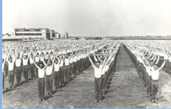
Cadets at Physical Training, Maxwell Field during World War II

On 6 September 1941, the Air Corps Replacement Center opened at the field. To meet the replacement center's requirements, the government acquired another 60 acres and 100 additional facilities. The center provided candidates for pilot, bombardier, and navigator training with classification and preflight instruction. In mid-1942, the center became the preflight school for pilots and later expanded to include preflight training for bombardier and navigator trainees.