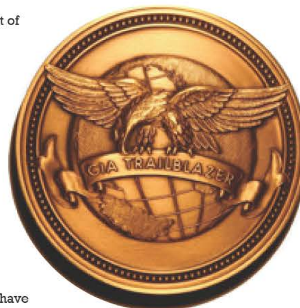
CIA Trailblazer Award