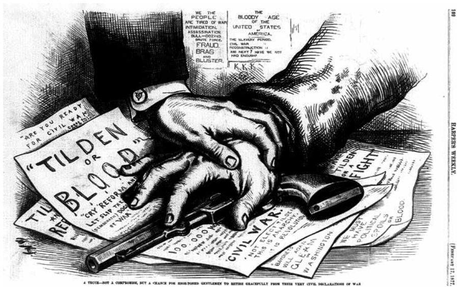
Figure 3. Reconciliation rather than bloodshed, 17 February 1877. (Reprinted from HarpWeek, “A Truce, Not a Compromise,” http://elections.harpweek.com/1876/cartoon-1876-Medium.asp?UniqueID=40&Year=1876 .)

South Carolina, and Louisiana invalidated enough returns from counties rife with violence to declare” Republican candidate Rutherford B. Hayes victorious. 5 Democratic newspapers in the South called for “Tilden or war,” while former slaves were convinced that a Tilden victory meant a renewal of slavery. In opposition to Democrats’ threats of an armed “march on Washington,” Republicans insisted Hayes would have won easily in an honest election and vowed to resist Tilden’s attempt to seize the presidency through violence and fraud. 6 The election crisis of 1876, therefore, served as the political pivot that pointed the South either back to open revolt or political reconciliation and enduring stability in exchange for aborted social change (fig. 3).