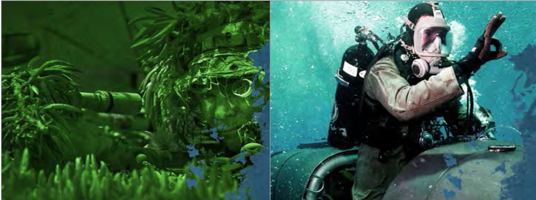
(Left) Figure 1. A sniper participates in jungle reconnaissance training.

According to the NSWC website, NSWC provides personnel, trains, equips, deploys, and sustains Naval Special Warfare forces for operations and activities abroad in support of combatant commanders and U.S. national interests. NSWC is the maritime component of USSOCOM, organized around eight sea, air, and land (SEAL) teams; one SEAL Delivery Vehicle Team; three special boat teams; and supporting commands, which deploy forces worldwide.