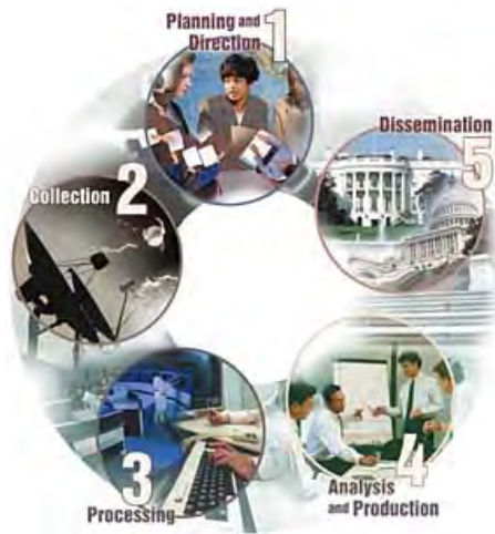
Figure 3. CIA Intelligence Cycle 53