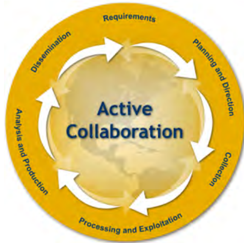
Figure 1. FBI Intelligence Cycle 51