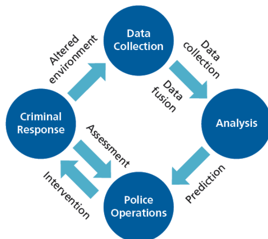
Figure 5. The Prediction-Led Policing Business Process Model, RAND RR233–1.1 62

The terrorist events of 9/11 vastly transformed law enforcement communities across the U.S. and the approach to preventing and combating terrorism that focused on proactive posturing versus reactive engagement. 63 New transnational enemies possibly operating within the homeland in the form of international terrorists and transnational issues, such as narcotics and money laundering have risen in importance becoming more urgent than the previous Cold War era geopolitical concerns. As the intelligence and law enforcement communities have both become increasingly involved in the international aspects of terrorism, drug trafficking, and international organized crime, the National Network is positioned to access the USIC’s considerable wealth of information on these subjects. However, in considering the fulfillment of these capabilities by the HSE, this issue has been the most difficult to resolve. 64