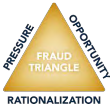
Figure 1. The Fraud Triangle (from Thoresen, Diaby, Helle, Condon & Hodge, 2013)

The opportunity portion of the triangle refers to individuals identifying circumstances and/or vulnerabilities within their company that they can exploit for personal gain (Wells, 2005). The individual identifies a way to use his or her position to commit the fraud and believes that there is a low risk of getting caught (ACFE, 2014e). Examples of such vulnerabilities include a lack of oversight or supervision or too much trust/responsibility placed in one individual (Wells, 2005). Rationalization refers to how the fraudsters justify the crime to themselves. Most are first-time offenders who see themselves as "ordinary, honest people who are caught in a bad set of circumstances" (ACFE, 2014f). Rationalization allows them to view the crime as justified or acceptable. Common rationalizations include the individuals feel they were owed the money, their employer deserved it, or that fraud is a victimless crime (Biegelman, 2013).