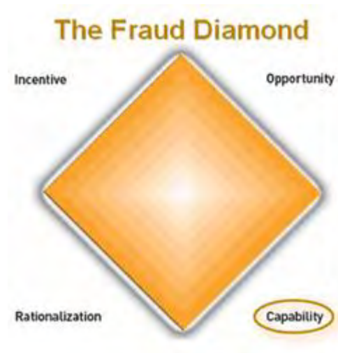
Figure 2. The Fraud Diamond (from Hermanson & Wolf, 2004)

traits and abilities include intelligence, self-confidence, and “being able to handle the stress that occurs when perpetrating fraud” (Biegelman, 2013, p. 10; Hermanson & Wolfe, 2004).