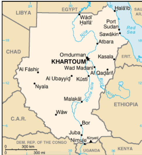
Figure 3: Map of Sudan