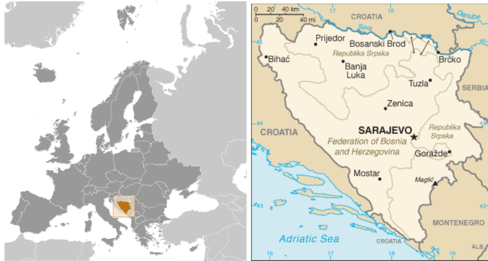
Figure 2: Map of Bosnia