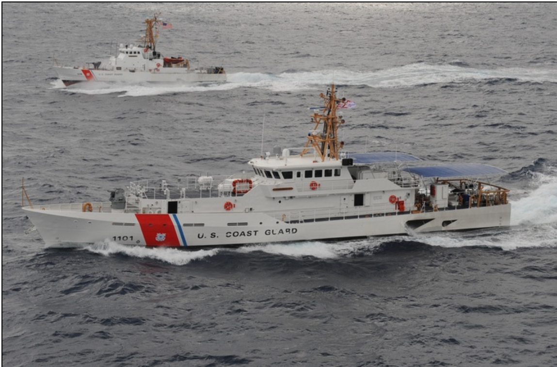
Figure 3. Fast Response Cutter (With an older Island-class patrol boat behind)