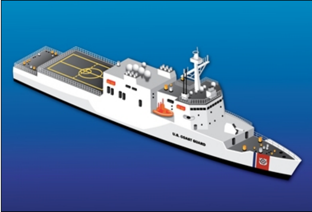
Figure 2. Offshore Patrol Cutter (Generic Conceptual Rendering)