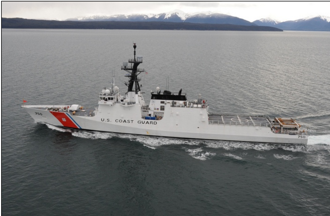
Figure 1. National Security Cutter