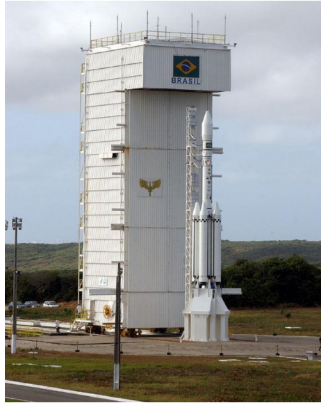
Figure 2. The VLS-1 V3 vehicle on the launch pad. 124

As technicians prepared the vehicle for its 25 August 2003 launch date, one of the four outer solid rocket motors ignited spontaneously, killing 21 technicians and engineers and destroying the launch pad. 125 Figure 3 shows the aftermath of the explosion. Popular media in Brazil forwarded the theory that the United States sabotaged the program in such a way as to cripple further development. 126 An investigation conducted by COMAER, however, ruled out the possibility of sabotage, theorizing that a static electricity discharge from one of the technicians to the ignition circuitry may have been responsible for the accident. 127 The COMAER report also criticized poor management and substandard equipment and parts. 128 Further investigation by the Brazilian Congress