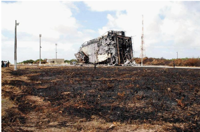
Figure 3. The ruins of the VLS launch tower. 130

found that budget constraints contributed to the accident. With restricted and uncertain budgets, the program could not launch frequently, leading to an undertrained technical cadre. 129