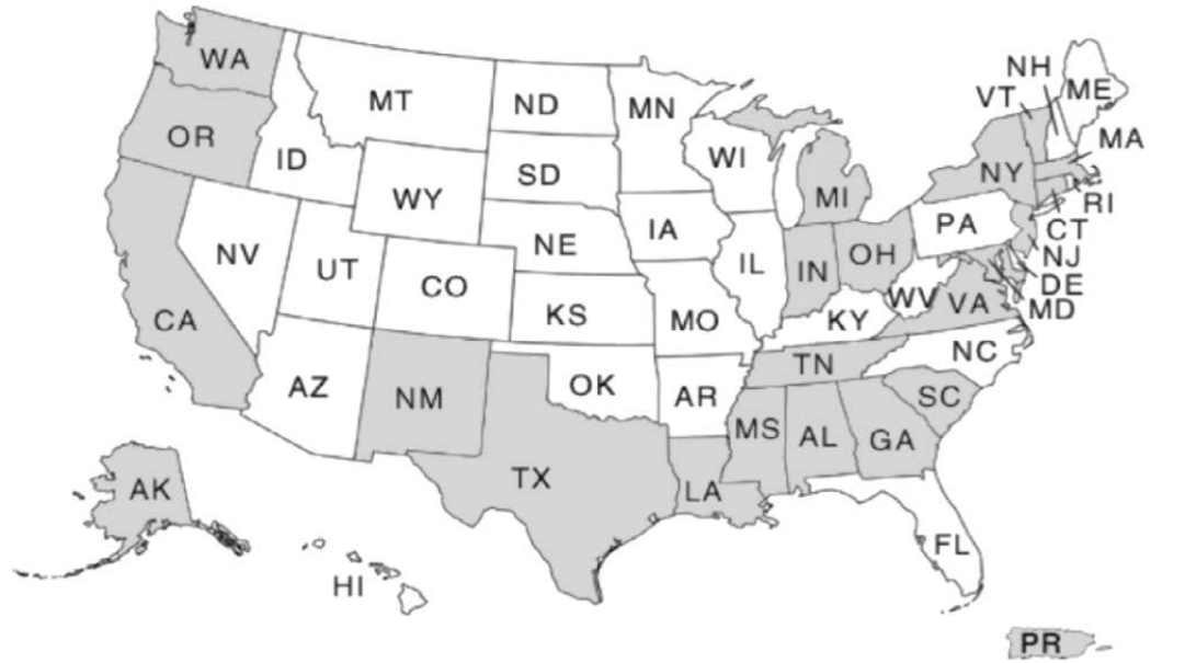
Figure 1. Location of SDFs as of March 2014. 19

Militia, and New Jersey Naval Militia were activated to assist in response measures, recovery efforts, and critical infrastructure security.” 18