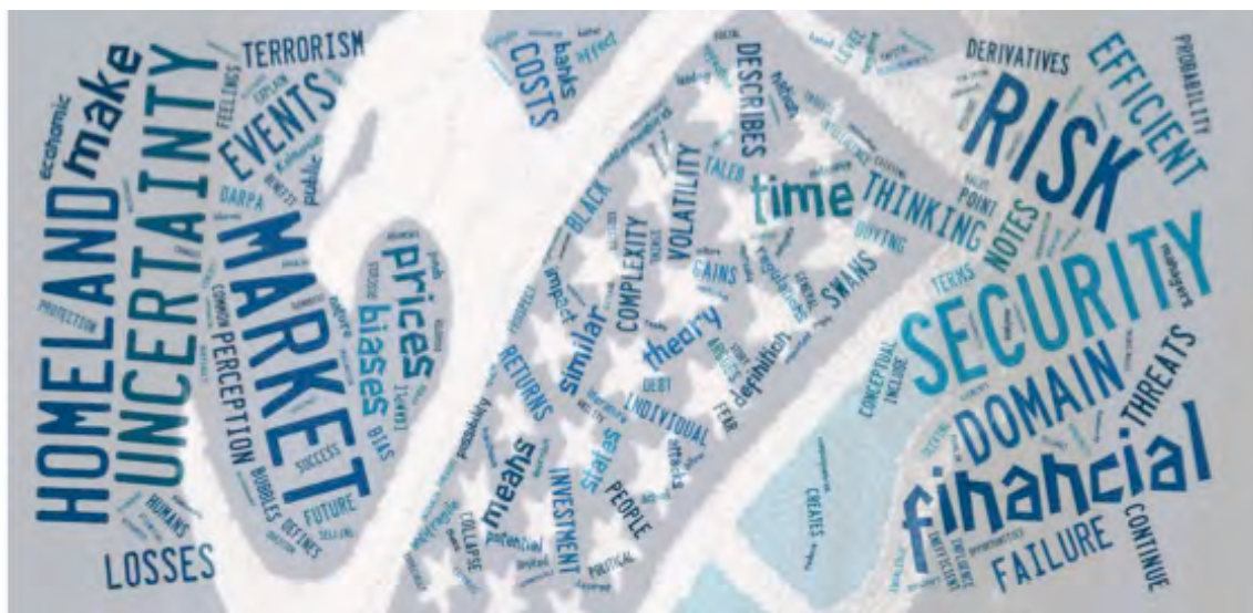
Figure 2. Thesis word cloud: Visually interpreting the major themes of this thesis and how they fit into the picture of homeland security. 18

quantitative and qualitative waters of risk every time they “open their wallets” to buy or sell securities. Market participants, whether investors or homeland security practitioners, react to risk that is inherent in markets. Neo-classic economic thought and diverse fields such as behavioral economics, psychology, prospect theory, and complex systems, illustrate why markets behave as they do and how humans understand and react to risk and uncertainty (see Figure 2). 17