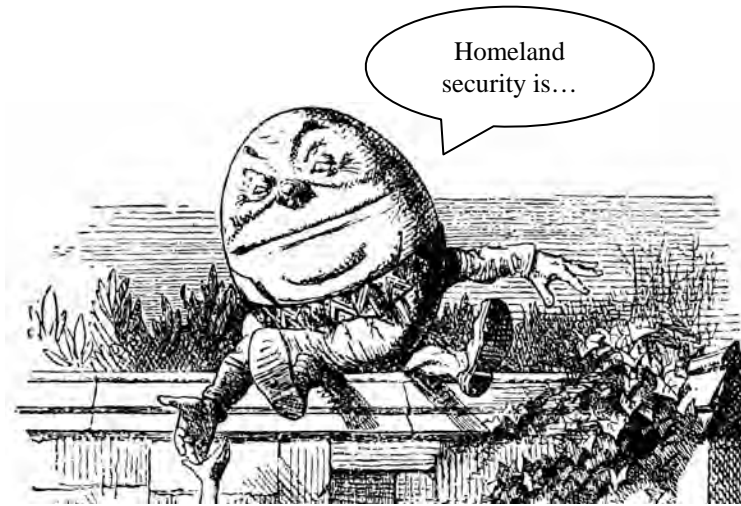
Figure 6. Humpty Dumpty in the midst of a discussion with Alice on the meaning of homeland security (adapted from illustration by John Tenniel from Carroll's Through the Looking Glass .)

As Humpty Dumpty alludes, homeland security can mean different things to different people. However, varying definitions of homeland security can cause misalignment with budgets and homeland security strategies. 179 While the definition of homeland security continues to evolve, this thesis sets out to understand homeland security through the lens of risk and uncertainty. It looks across domains to financial markets to explore how humans interact and make decisions when surrounded by risk that is dynamic.