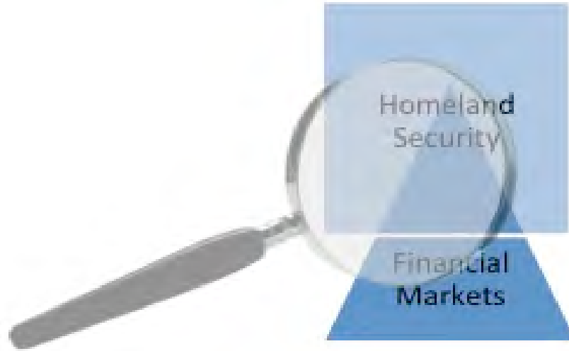
Figure 4. Literal analysis: Examining the overlay of homeland security and financial markets. Learning is by ‘seeing’ attributes, relationships, and similarities common to both domains.

The literature review discusses the advantages and limitations of using metaphor and analogies to integrate new information and ideas with prior knowledge. The literature review also examines research on risk and uncertainty to better understand their multiple dimensions, definitions, and nuances.