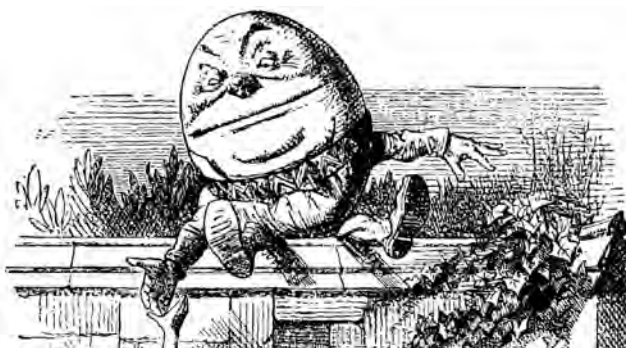
Figure 1. Alice meets Humpty Dumpty. Illustration by Tenniel from Carroll's Through the Looking Glass .

“Not so,” said Humpty-Dumpty, “the question is which is to be the master. That’s all.” 13