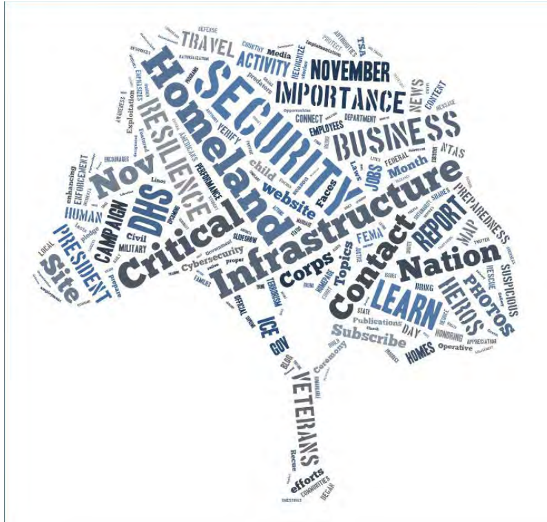
Figure 5. A homeland security tree. Trees grow antifragile through regular trimming and pruning. Homeland security or a financial portfolio, considered as a tree, also grows antifragile through regular trimming and rebalancing. Word cloud illustration of www.dhs.gov , created at Tagxedo.com .

Likewise, a homeland security tree might also grow stronger, healthier and more antifragile when subject to the volatility and stress of regular pruning and trimming. This means that Congress and DHS should evaluate oversight and accountability, and continuously assess security activities, adjusting or eliminating activities whose costs are incommensurate with the expected gains. A clear example of via negativa is reform of DHS Congressional oversight.