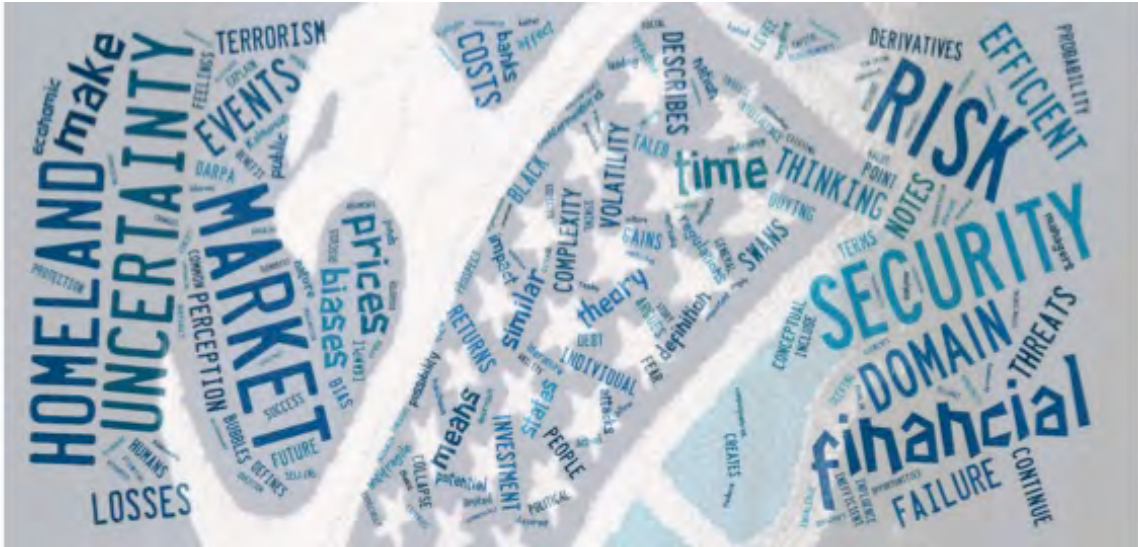
Figure 1. Thesis word cloud: Visually interpreting the major themes of this thesis and how they fit into the picture of homeland security. 3

Studying the financial domain requires understanding how investors allocate limited assets over time under conditions of certainty and uncertainty. Similarly, studying the homeland security domain requires considering how Americans allocate limited resources on a rational or seemingly irrational prioritized risk basis to prevent or mitigate terrorist attacks within the United States. This requires reducing the vulnerability of the strategic components of American power, which includes the economy and its financial domain. 4 Financial markets have huge implications for the solvency of the nation and the general condition of the economy. Protecting the security and confidence of others in the nation’s economy and financial systems is one of the key objectives of the homeland security domain. 5