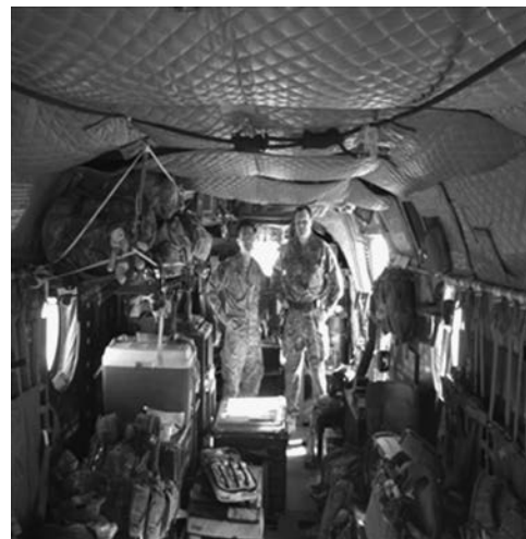
Figure 2. Medical Emergency Response Team.

In addition to hemostatic advanced dressings and tourniquets, early hemostatic resuscitation with prehospital blood products is a key component of DCR. The MERT-E carries a cold box containing 4 U of O-positive packed red blood cells (PRBCs) and 4 U of fresh frozen plasma (FFP), and any dispensed blood products are given through a fluid warmer. The decision to transfuse is physician led and is intended for critically shocked patients who are considered salvageable. These