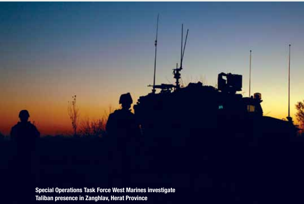
Special Operations Task Force West Marines investigate Taliban presence in Zanghlav, Herat Province