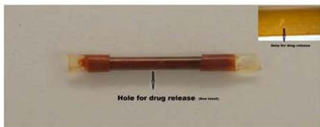
Figure 1. The drug delivery system with microhole on the surface. Hole diameter = 200 \mu\text{m} ; Tube diameter = 1.8 mm; Tube length = 20 mm. The size of the device and the perforations can be scaled to fit the need of the therapeutic application [12].