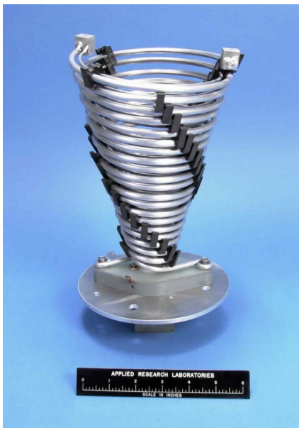
Figure 2. Collapsible FLEX antenna shown in its deployed configuration

implemented and tested provided a basis from which the small radio development could be accelerated. Therefore, the high data rate radio developed this year is ahead of schedule by nearly a full year. The commercial radio system was not pursued.