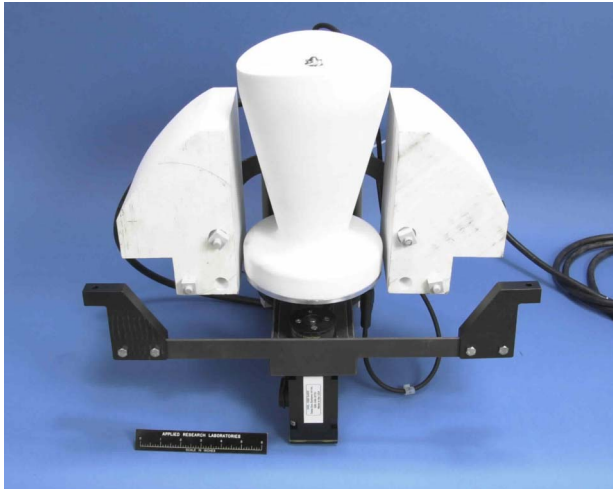
Figure 1. HF radio, pressure housing, and retractable antenna assembly for UUV

There were three major efforts that were pursued. The first was to develop an antenna and antenna deployment system that would be compatible with UUV operation, and be mechanically robust enough to withstand wave-slap when deployed. This antenna design is based on a previous design described in [1-3]. The second was to perform the design, fabrication, and test of an electronic pressure housing.