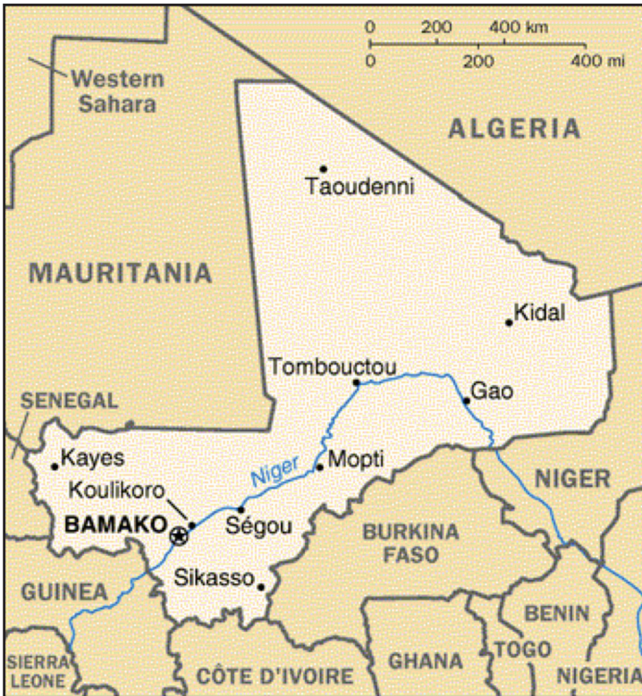
Figure 1.1 Map of Mali