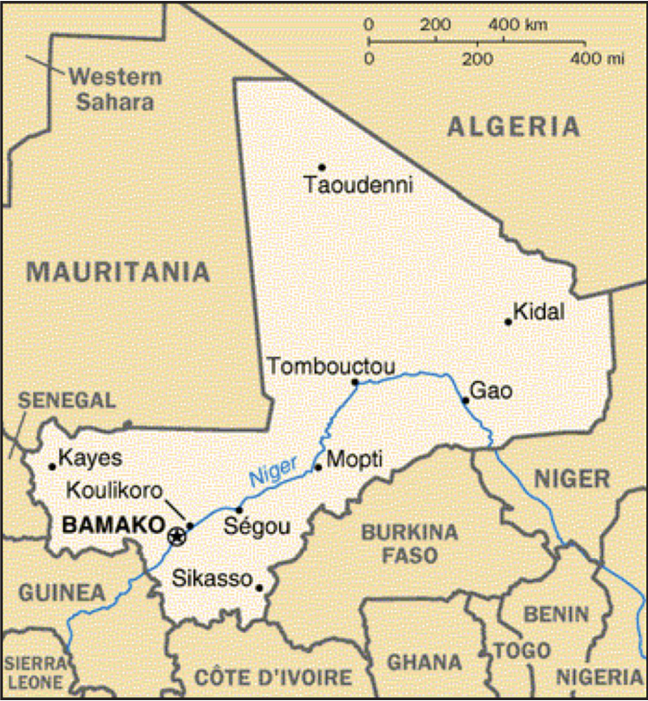
Figure S.1 Map of Mali

SOURCE: Central Intelligence Agency, "Mali," last updated June 20, 2014a. RAND RR892-S.1