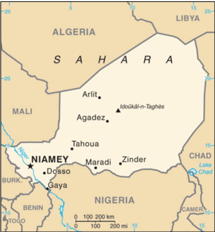
Figure 5.1 Map of Niger

SOURCE: Central Intelligence Agency, "Niger," last updated June 20, 2014b.