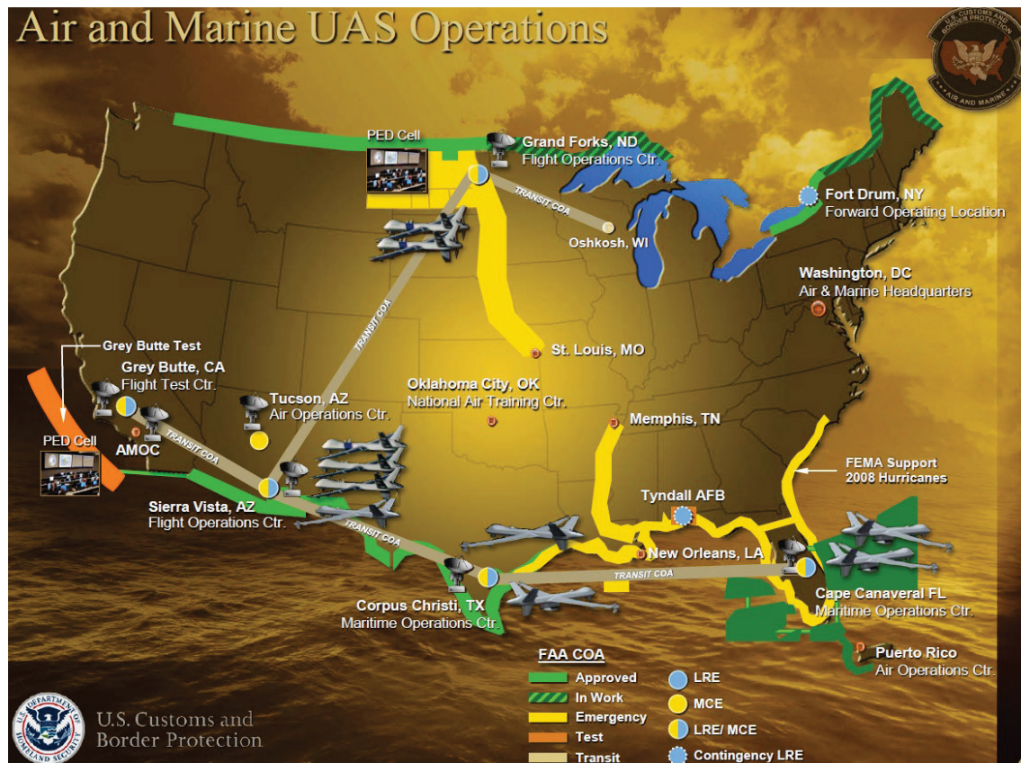
Figure 3.1 U.S. Customs and Border Protection Air and Marine Unmanned Aircraft Systems Operations