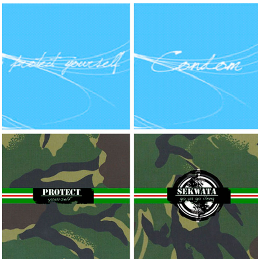
Figure 1. An intervention study examining the effects of condom wrapper graphics and scent on condom use in the Botswana Defence Force: condom wrapper designs.

Baseline condoms consisted of government-issued condoms (Lorato® or Carex®) or other brands used by participants. The intervention condom was manufactured by Thai Nippon Rubber Industry (Thailand), and selected by the BDF because members perceived it to be of a “higher quality” than the government-issued condoms. The intervention condom was packaged in either a generic or customized military wrapper (Figure 1), and available as scented (e.g., vanilla) or unscented. Sites S1 and S2 received condoms packaged in the generic wrapper; “Condom” was printed on one side and “Protect Yourself” was printed on the other. Sites N1 and N2 received condoms packaged in a customized BDF military wrapper; “Protect Yourself” and “SEKWATA go ya go ileng” (“Sex Education Knowledge with AIDS Testing Awareness until the end of time”) were printed