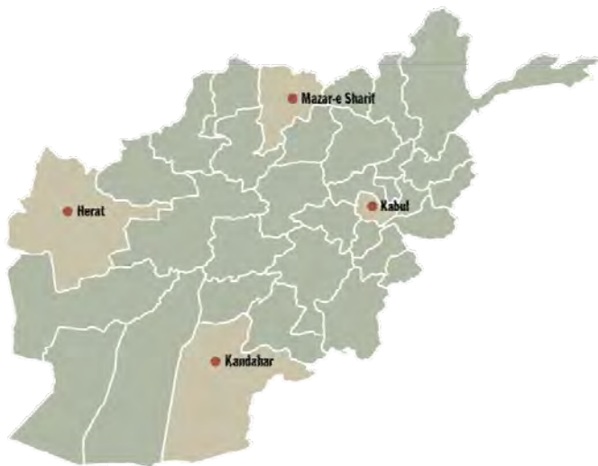
Figure 1 - Afghanistan's Four International Airports

The Afghan government reports that it has 67 international and domestic airports. Its four international airports are located in Kabul in the east, Kandahar in the south, Herat in the west, and Mazar-e Sharif in the north. Figure 1 shows the location of the four international airports.