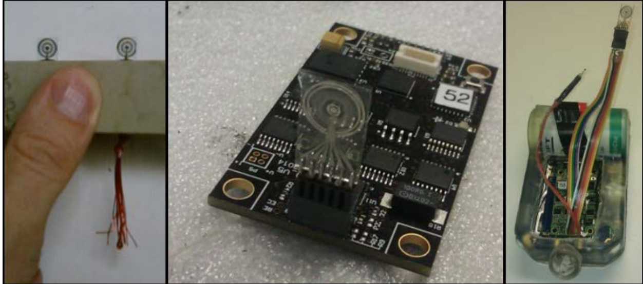
Figure 1: Two CT sensors (left), a single CT sensor including interface board (middle) and a CT package integrated into a SRDL (right) are shown.

This interface is simplifying the integration process into the existing SRDL system, but will also enable others to integrate the CT-package easily (Figure 1).