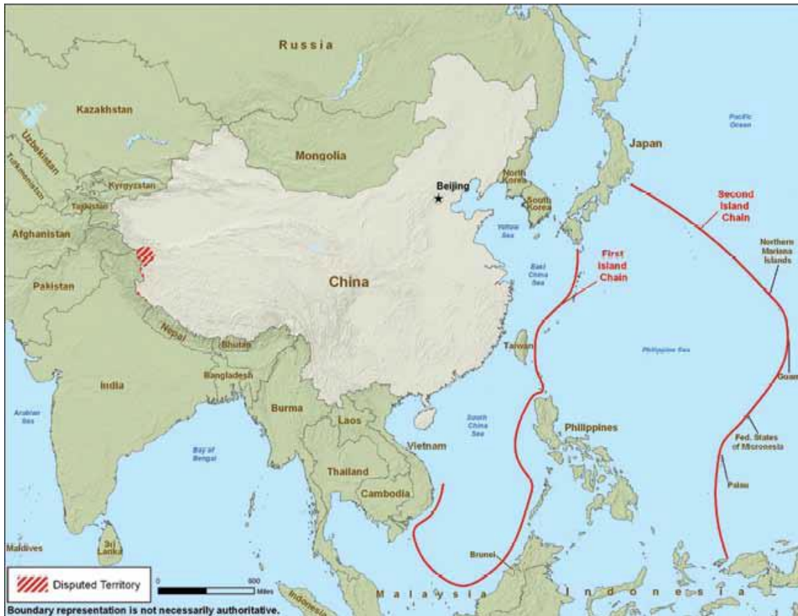
Figure 1. China's Anti-Access/Area Denial Island Chain Lines of Influence