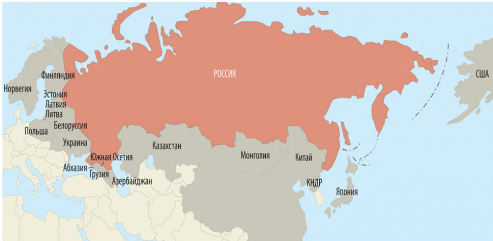
Map 1. Russian Territorial Borders.