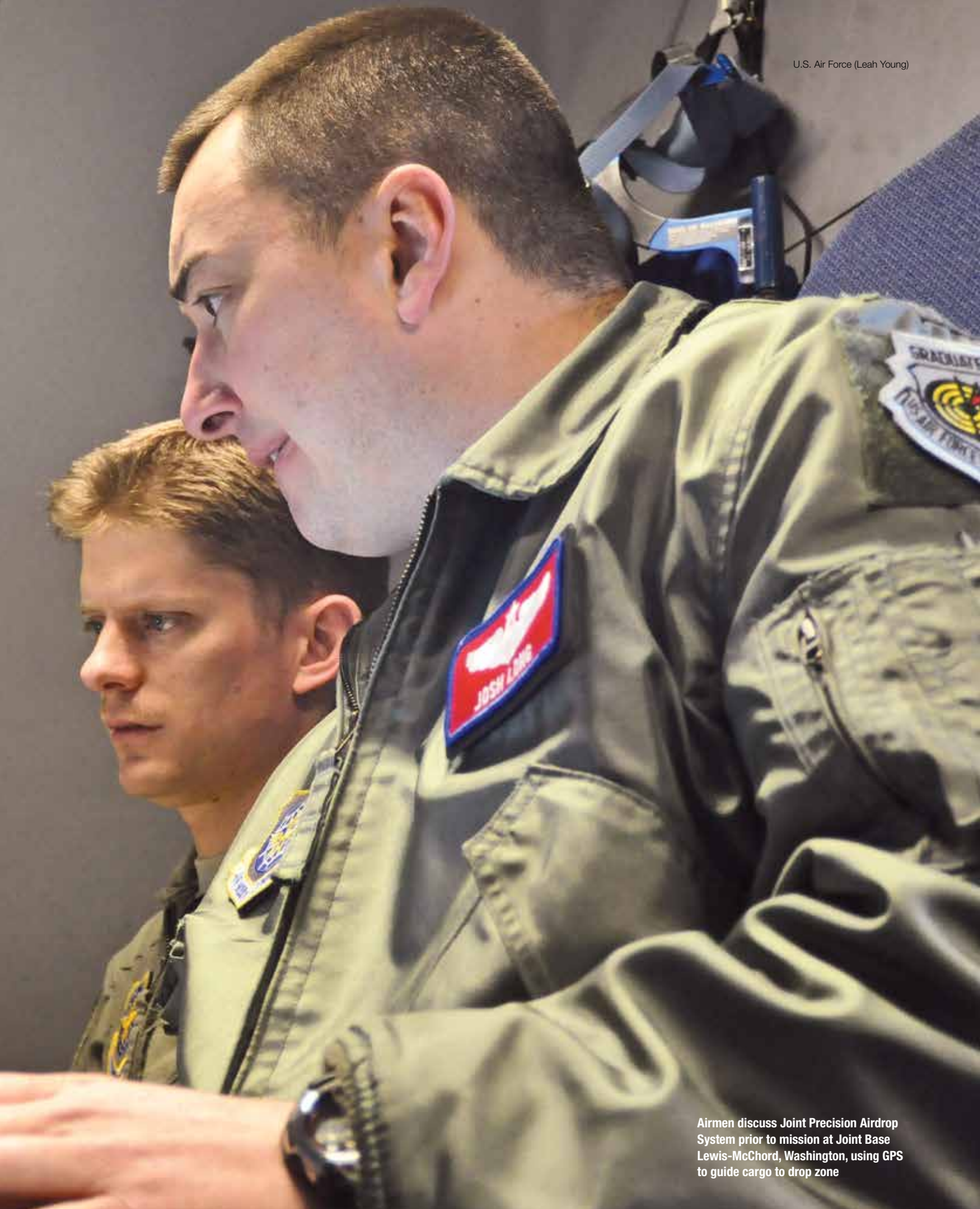
Airmen discuss Joint Precision Airdrop System prior to mission at Joint Base Lewis-McChord, Washington, using GPS to guide cargo to drop zone