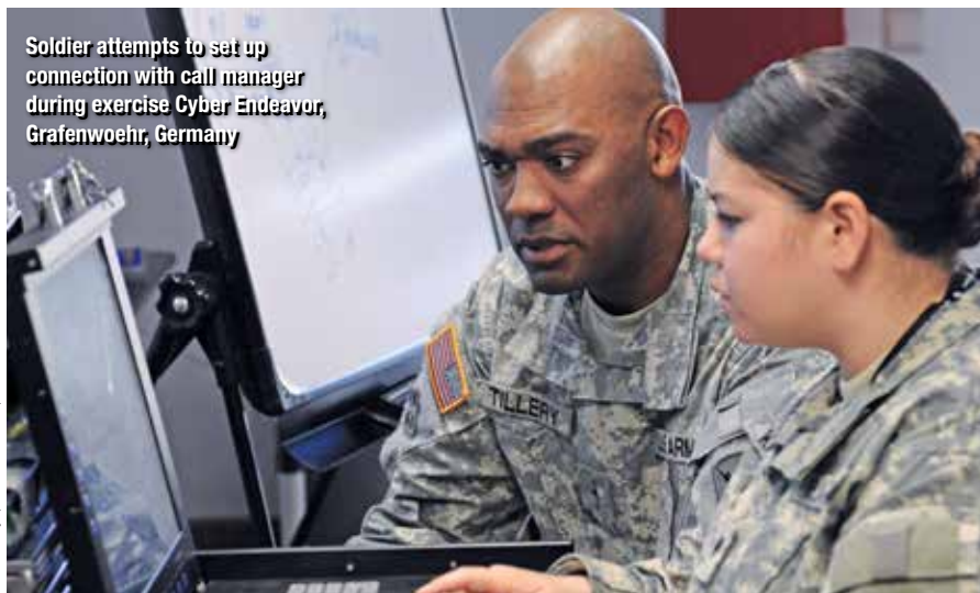
Soldier attempts to set up connection with call manager during exercise Cyber Endeavor, Grafenwoehr, Germany