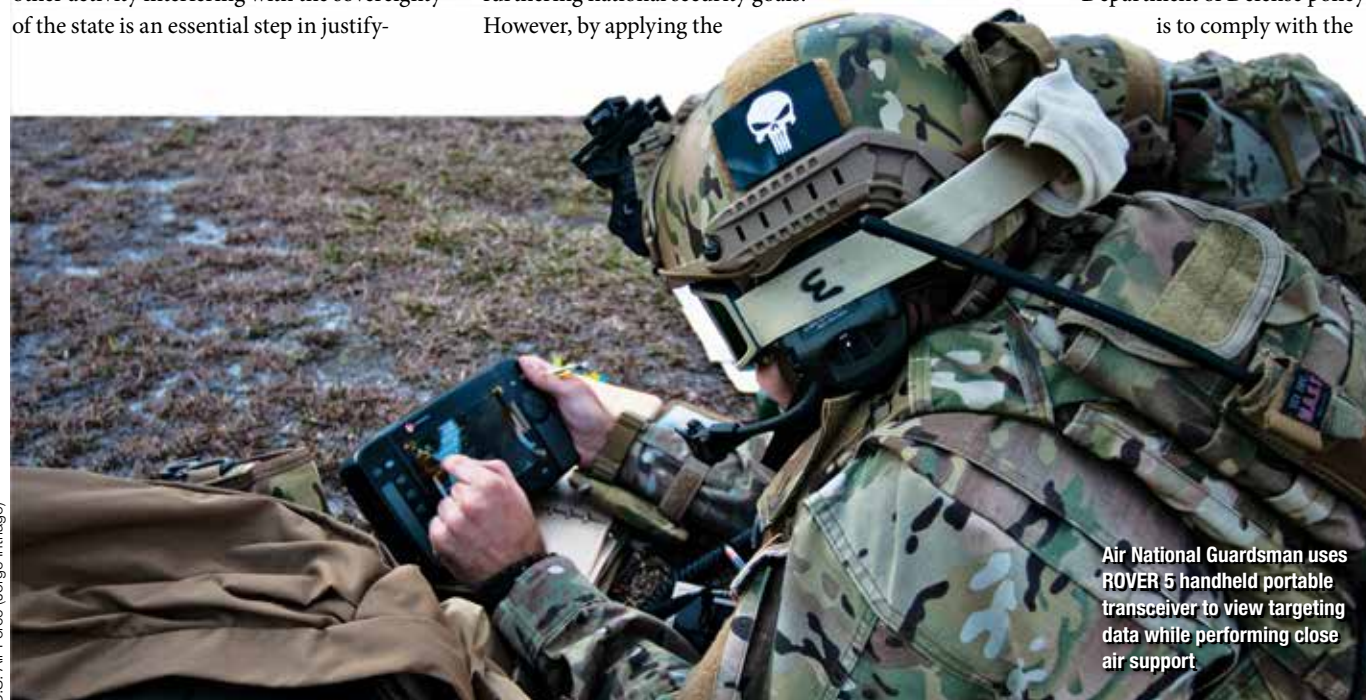
Air National Guardsman uses ROVER 5 handheld portable transceiver to view targeting data while performing close air support

Department of Defense policy is to comply with the