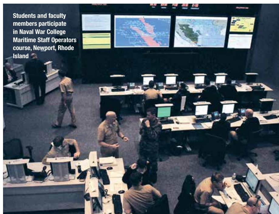
Students and faculty members participate in Naval War College Maritime Staff Operators course, Newport, Rhode Island

This confluence of expertise, as well as the general creativity of young officers serving among the multitude of operational planning teams during OOD, enabled the staff to provide concise new ideas for course of action (COA) development, which was always in flux based on the evolving situation in Libya. Whereas the NWC curriculum for MSOC and JMO presents the execution of an operation over a timeline of weeks to months, OOD demanded a compressed timeline of hours to days due to the nature of the uprising and the swift response of Qadhafi's security forces. Junior officers assigned to the JOC were instrumental in ensuring that senior officers of the JFMCC and JTF staffs could