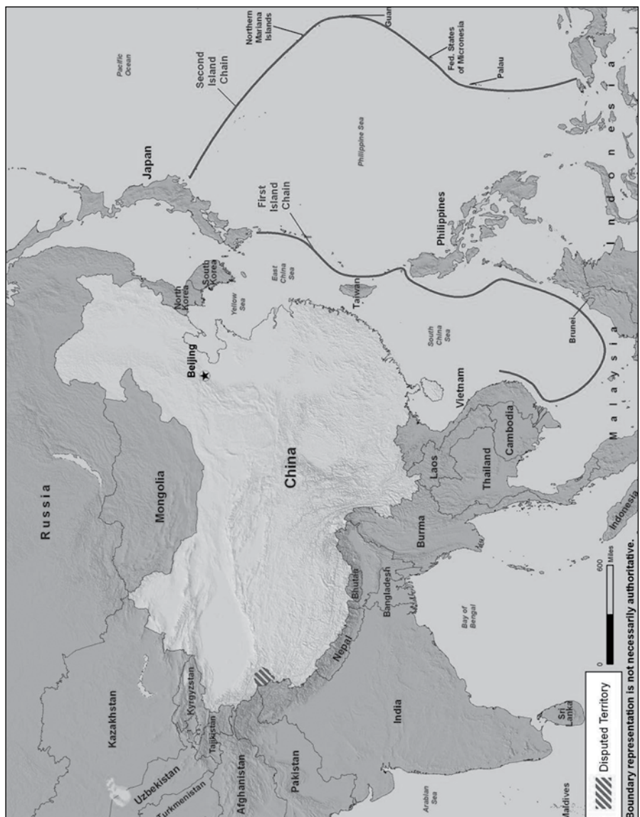
Figure 2. The First and Second Island Chains.