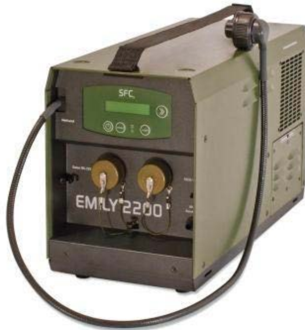
Figure 3 The Emily 2200 [12]

An example of a DMFC designed for military use is the SFC Emily 2200. This system is MIL-STD-810F (humidity, sand and dust, vibration and drop) compliant [12]. The Emily 2200 is a 90 W 12/24 VDC system that weighs 12.5 kg and is designed for vehicle use [12]. It is the only direct methanol APU identified by this investigation that is compliant with military specifications. However, its low power output and low power-to-weight ratio makes it unsuitable for integration with a military vehicle for the purpose of extending silent watch. This is likely due to the severe technical limitations of current DMFCs discussed in the preceding section. It is unlikely more DMFC Military Off-The-Shelf (MOTS) or Commercial Off-The-Shelf (COTS) vehicle APUs will become available until significant technological advances have been made.