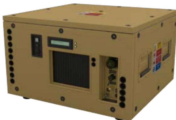
Figure 5 Nordic Power SOFC [15]

Nordic Power is developing a 1 kW, diesel-powered SOFC system designed for use as an APU in military vehicles [15]. At the time of writing, in early 2014, this is not a mature product. According to Nordic Power's website, demonstration units were expected to be shipped late 2012, however due to delays this did not occur [15]. At the time of writing the company would not give any indication when they would have a completed product. This is indicative of the state of the fuel cell APU market where many products are still in final stages of development and production delays are common.