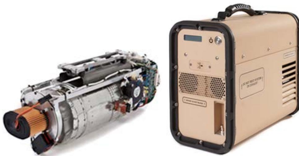
Figure 4 The D245XR (left) and the D300 (right) [13]

The Defender series consists of the D300 and D245XR fuel cells. The D300 is a 10.9 kg, 300 W system that can output 12, 14, 24 or 28 V. It is rated to MIL-STD-810F (Rain, sand and dust, shock and vibration) [14]. At 2.6 kg, the D245XR is a much lighter system and with a 245 W peak output has a much higher power to weight ratio compared to the D300 [14]. However, the D245XR has not been environmentally tested and is limited to a 28 V DC output [13] (which is preferred for military land vehicles). It is likely that at 300 W and 245 W both systems will provide a significant percentage of silent watch power in typical vehicles. In low load scenarios, such as cases where silent watch equipment has been pared back to essential equipment only, the D300 may provide 100% of silent watch power. This means that in the best case scenario in some vehicles the D300 could extend silent watch as long as fuel is available. Under typical silent watch load scenarios, the D300 would reduce the load on the batteries, and extend silent watch battery endurance. Both these products use 112 g of propane per hour from a camping stove gas cylinder [13, 14]. This may be a significant advantage over systems that use specialised fuels such as methanol and hydrogen.