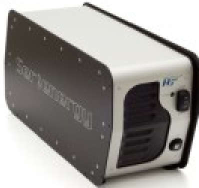
Figure 2 The H3 350[9]

The H3 350 Methanol Power System is a fully independent system which includes a PEMFC, an external fuel reformer and a rechargeable battery for power to start the fuel cell[9]. This is a mature system that currently has an application as the drive power source for small gardening/utility type vehicles and is suitable for use as an APU [9]. It has a maximum power output of 350 W [9]. 350 W is likely to be a significant percentage of silent watch power in typical vehicles but the vehicle batteries may need to provide additional power. In low load scenarios, such as cases where silent watch equipment has been pared back to essential equipment only, the fuel cell system may be able to provide 100% of silent watch power. This means that in the best case scenario in some vehicles this system could extend silent watch as long as fuel is available, however, if the fuel cell was being used to recharge the vehicles' batteries, its limited power output would result in an unacceptably long recharge time. The system weighs 13.7 kg. At peak power it uses 350 mL of fuel per hour [9].