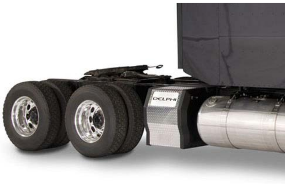
Figure 6 The Delphi SOFC APU mounted to a truck [18]

Delphi has developed a 5 kW SOFC designed for fitting to commercial trucks. The system outputs 110 VAC or 12 VDC and can use natural gas, propane or diesel as fuel [18]. According to conversations with company representatives, Delphi is currently searching for a large enough customer to justify the cost of going into production. At 5 kW the Delphi system would provide all the silent watch power needed for most applications and may provide additional export power. Although size and weight information was not available, the system is designed for integration with large commercial trucks, which have more space and weight available than most military vehicles. It is possible that size will make this system unsuitable for many military vehicles.