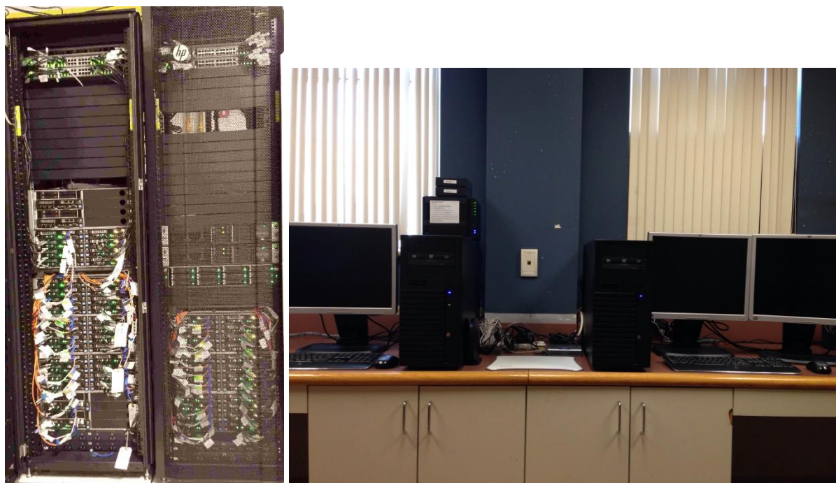
Fig 1. Left: Computational clusters from Hewlett-Packard acquired with DURP funds installed at high performance computer facilities at Rutgers Hill Center. Right: Workstations and Cloud Storage systems in students office at the Department of Chemical and Biochemical Engineering, Rutgers.