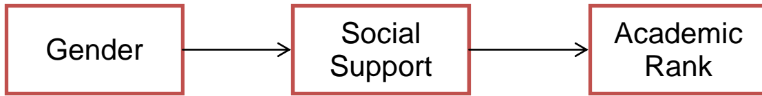
Figure 3: Social Support as a Mediator of the Relationship between Gender and Academic Rank

would be considered complete mediation. If the correlation stays significant after dropping from the added variable, the mediation is partial.