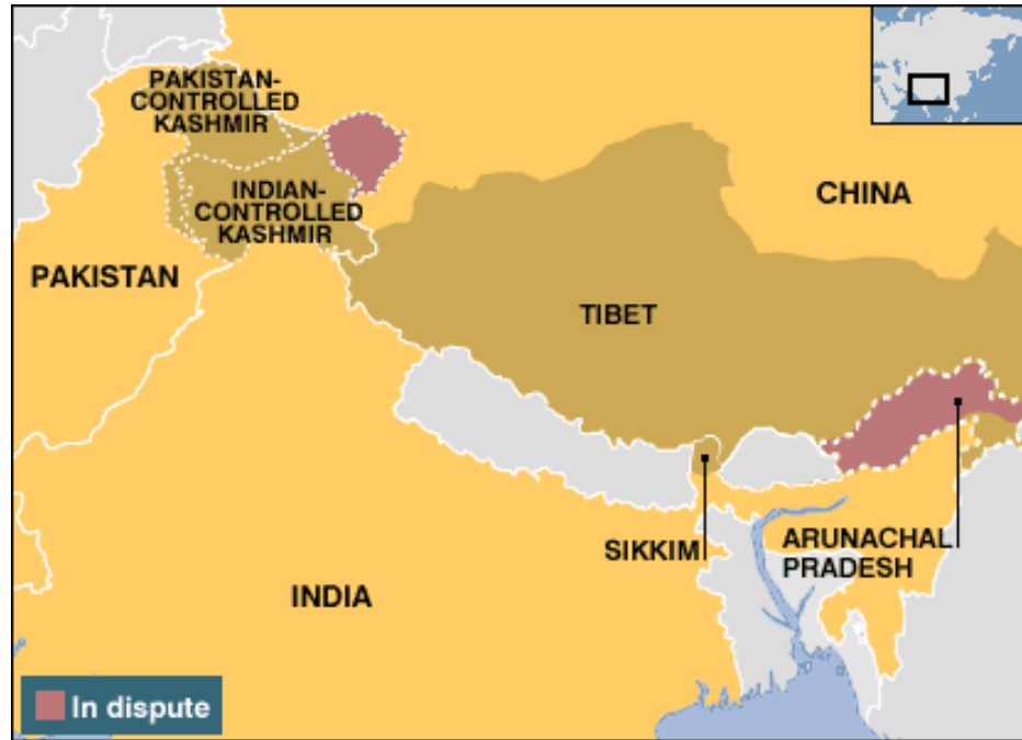
Figure 1: Eastern and Western Sectors in the Sino-Indo War.