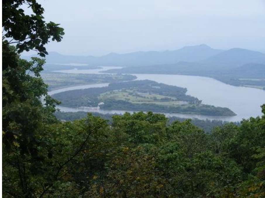
Figure 3: Image of Zhenbao Island