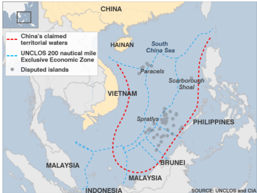
Figure 4: Parcel and Spratly Islands in the South China Sea