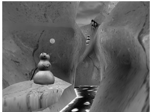
Figure 2 SnowWorld. A screenshot of what patients see in the goggles during immersive virtual reality pain distraction. World designed/developed by Hoffman and Patterson, University of Washington, Seattle, and software created by world builders at Firsthand.

nausea, and 10 = vomit),” and “While experiencing the virtual world, to what extent did you feel like you went inside the computer-generated world? (10-cm line with numeric and verbal descriptors: 0 = I did not feel like I went inside at all, 1–4 = mild sense of going inside, 5–6 = moderate sense of going inside, 7–9 = strong sense of going inside, 10 = I went completely inside the virtual