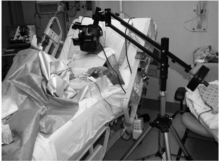
Figure 1 US Army soldier receiving immersive virtual reality (VR) to reduce his pain during severe burn wound care. The unique robot-like arm mounted VR goggles designed by Hoffman and built by Jeff Magula at the University of Washington, Seattle, holds the VR goggles near the patient's eyes weightlessly, reducing the amount of surface contact (if any) needed with the patient.

session, the patients interacted with the virtual world via the immersive VR goggles, shown in Figure 1.