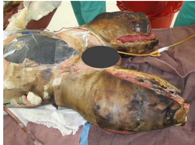
Figure 2. Burn amputee.

Military casualties with burns and other soft tissue trauma or illness are accepted using a system that spans the