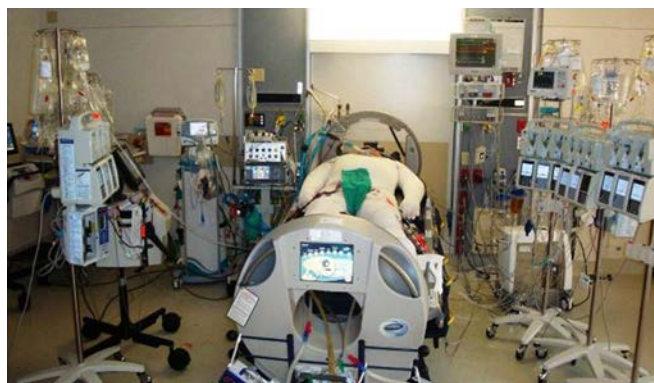
Figure 3. Acute care in the BICU.

The Combat Casualty Care Engineering Task Area maintains a constant presence within the Burn Center (Fig. 4). Its research team is actively involved in all aspects of BRDSS, electronic wound mapping, and data collection and integration