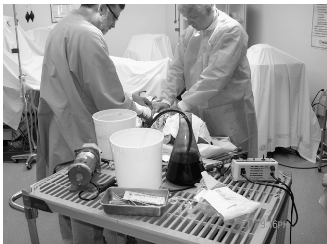
FIGURE 2. Photograph of the model setup in use with simulated blood, buckets, tubes, and pump.

the aorta to hold the tube and gasket in place for a watertight seal. Care was taken not to close the lumen at tie tightening. When intra-arterial blood clots or plaques were large, they were washed out or removed with forceps.