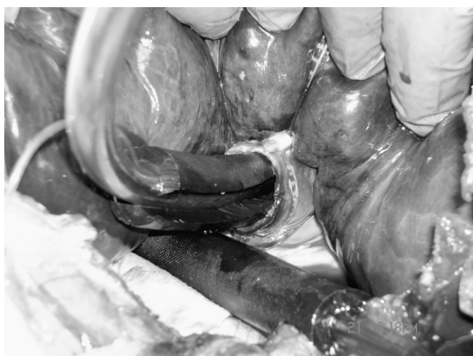
FIGURE 3. Photograph of the aorta instrumented. Rubber piping as a gasket overlies an endotracheal tube inserted into the descending thoracic aorta. The investigator’s gloved finger tips (at the top right of the photograph) retracts tissue.

An incision was made through the right vastus medialis muscle to expose the popliteal artery as it emerges at the adductor hiatus—the distal end of Hunter’s canal. The popliteal artery was exposed and transected to place a 4-mm surgical tube 3 cm into the proximal end of the artery so that bleeding and measurements of both flow rate and pressure could occur before, during, and after hemorrhage control device use. The tube was held in place and sealed with a 4-inch zip tie overlying the arterial wall. The distal end of the tube went into a 5-gallon bucket to drain, and the bucket was also filled partway with blood simulant as a reservoir for the