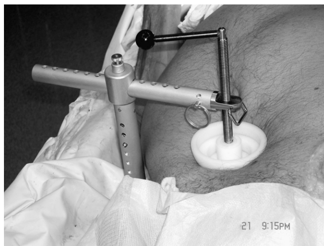
FIGURE 5. Photograph of a CRoC placed in use proximal to a right inguinal wound.

pump intake tube. Intra-arterial pressure was monitored by fluid-filled pressure transducers (model 156PC15GWL, Micro-switch, Honeywell Sensing and Control, Morristown, New Jersey powered by a TS430 bridge amplifier [Transonic Systems, Ithaca, New York]) in the distal end of the right femoral artery distal to the device tested. A descending thoracic aorta transducer was placed for proximal measurement. The pump was primed with 30 mL of blood simulant, and the distal arteries were rinsed and flushed with 3 L. The distal artery field