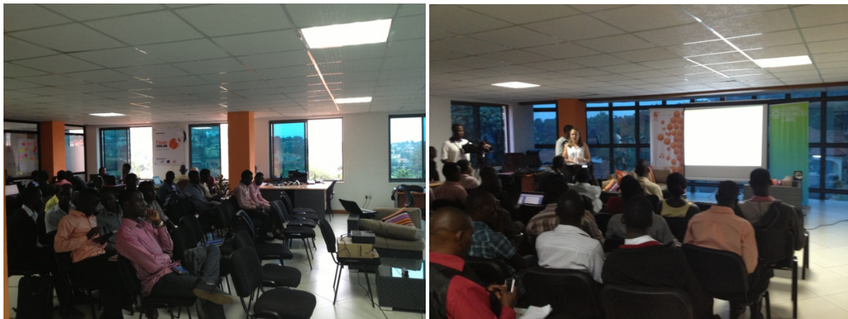
Kampala Tech Meet-up at Hive CoLab

Prior to the event, we were able to meet with and interview many of the attendees. After the event, we departed for the airport to return to West Point.