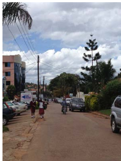
Kanjokya Road in Kamwokya