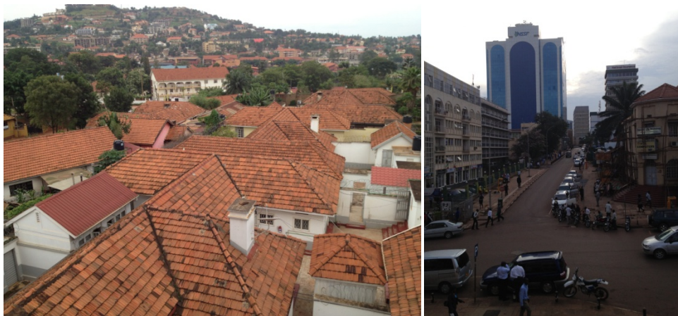
Views of Kampala