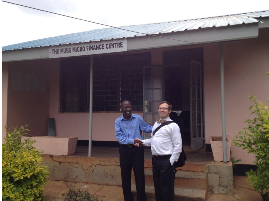
Micro-Finance Center at Makerere University Business School