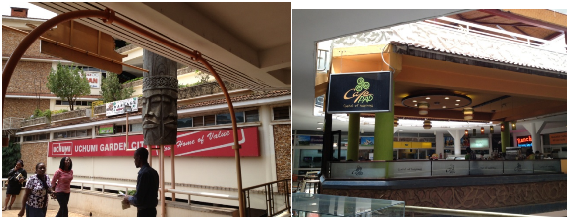
Garden City Mall Kampala