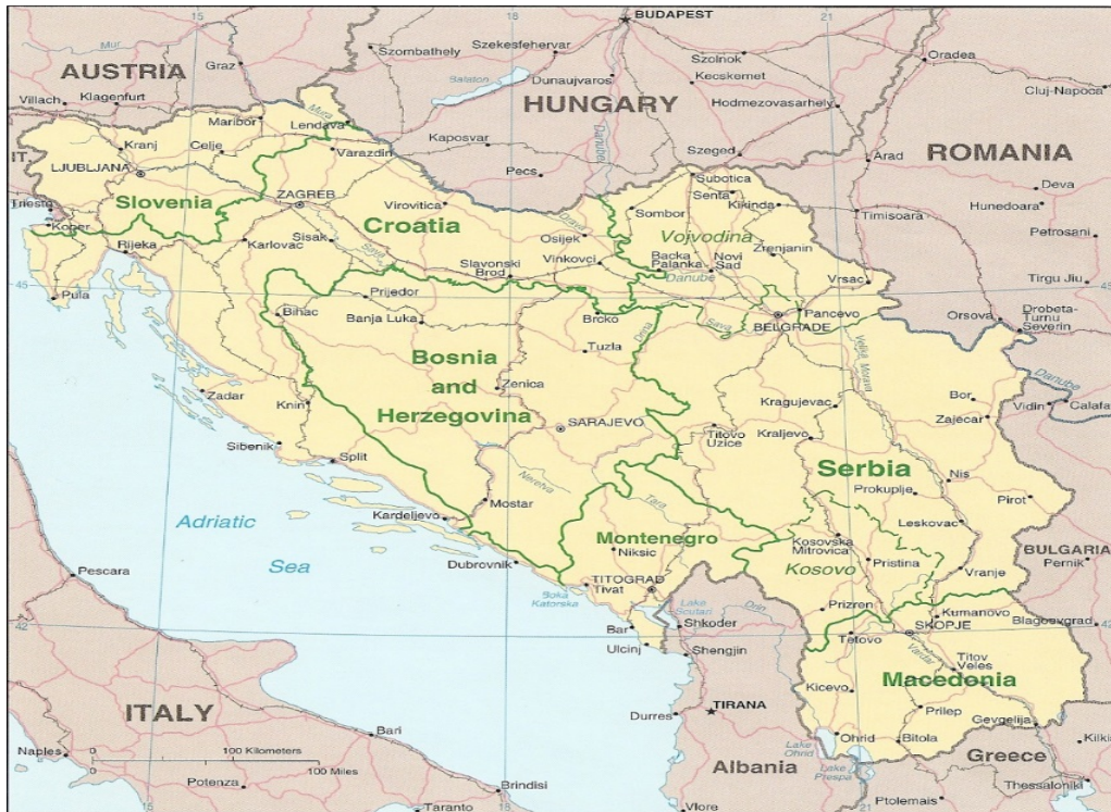
Figure 1. Socialist Federal Republic of Yugoslavia.

Source: Central Intelligence Agency, Balkan Battlegrounds: A Military History of the Yugoslav Conflict, 1990-1995, Vol. I. 5