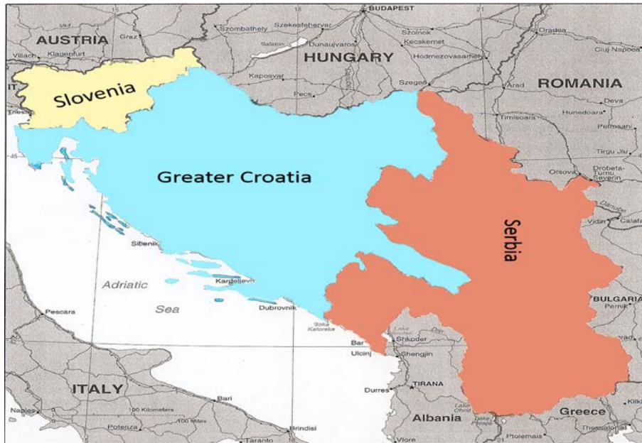
Figure 3. Greater Croatia.

Croatian nationalists in Croatia and Bosnia to fund not only his political party but also the armed wing of the party. 60 The HOS would fight in Croatia against the JNA and Krajina Serbs (SVK)