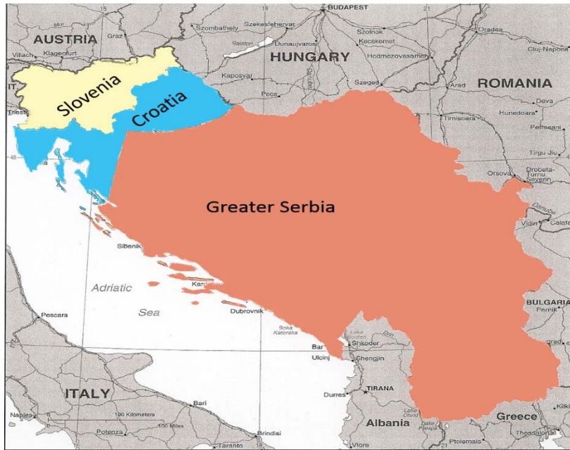
Figure 5. Greater Serbia.