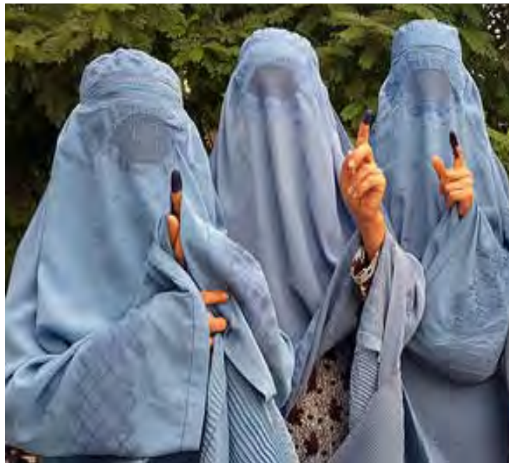
Women showing inked fingers after voting in Herat, June 14, 2014.

Officials from all three agencies reported that although the number of projects, programs, and initiatives specifically intended to benefit Afghan women will be consolidated after 2014, their efforts to support Afghan women will continue and, in some cases, the funding for these efforts will increase. However, the lack of agency-level assessments of the impact of these efforts to date, combined with ongoing challenges to implementing efforts to support Afghan women and with the U.S. government's expected reduced visibility over activities, will make it difficult for agency leaders and the Congress to understand and make decisions on future programs and funding in support of Afghan women.