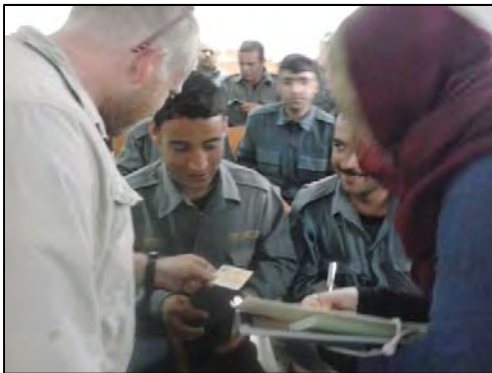
SIGAR Personnel Verifying ANP Identification Cards and Attendance

In its comments, U.S. Forces-Afghanistan welcomed all five recommendations and described actions it is taking, and plans to take, to implement them. SIGAR will continue to monitor these actions to ensure that the command fully implements the recommendations.