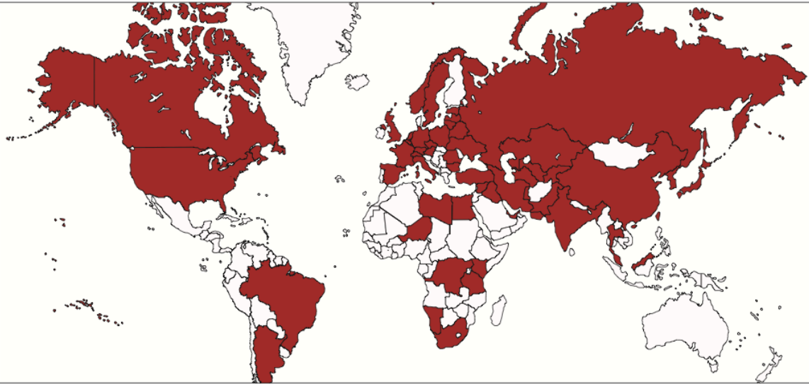
Regardless of intent or foreknowledge, countries in red have been implicated in the A.Q. Khan Affair and/or listed in the IAEA Illicit Trafficking Database.

Second, the international community has largely failed to develop a long term and sustainable WMD nonproliferation strategy that is suitable for emerging and developing countries. To date, the great majority of WMD nonproliferation programming, particularly in Africa, are seen as Western-imposed measures that are ill-connected to national and regional priorities. These