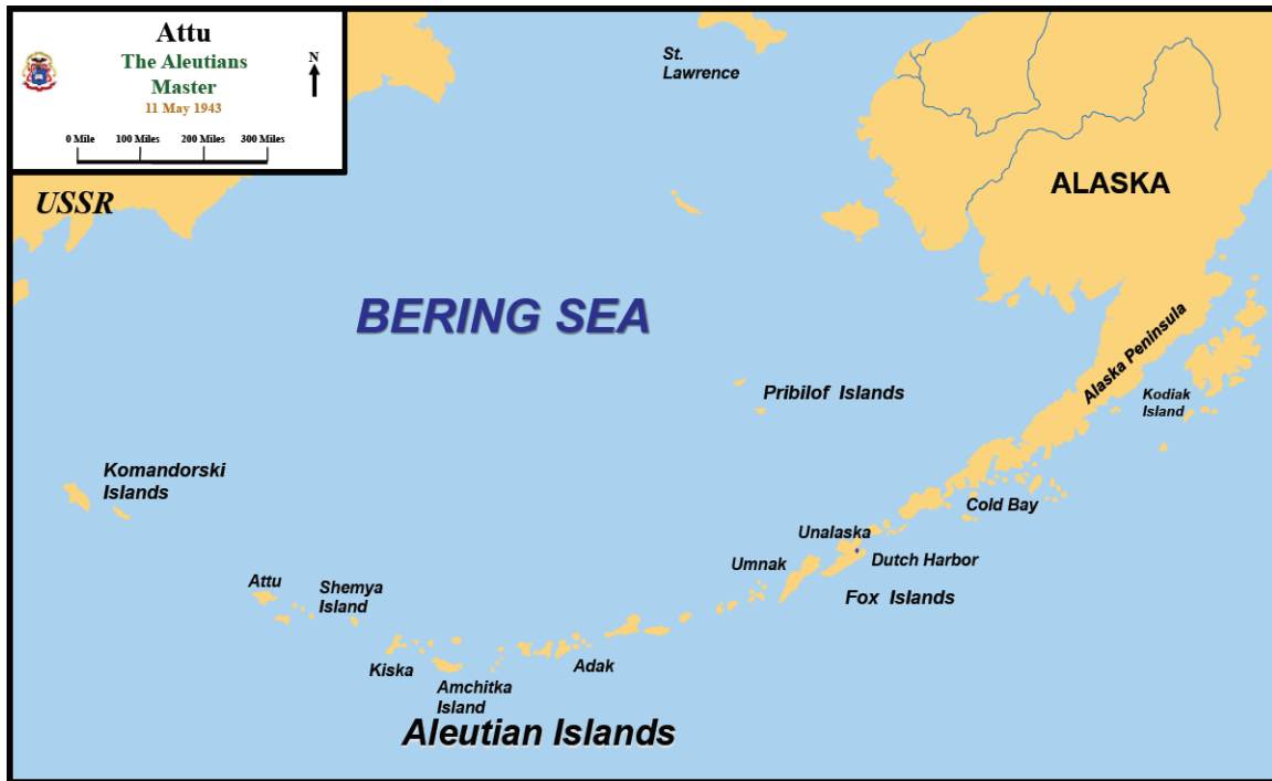
Figure 1: Map of Aleutian Island Chain

Source: Dr. Curtis King, map by Combat Studies Institute, email message with author, January 6, 2014.