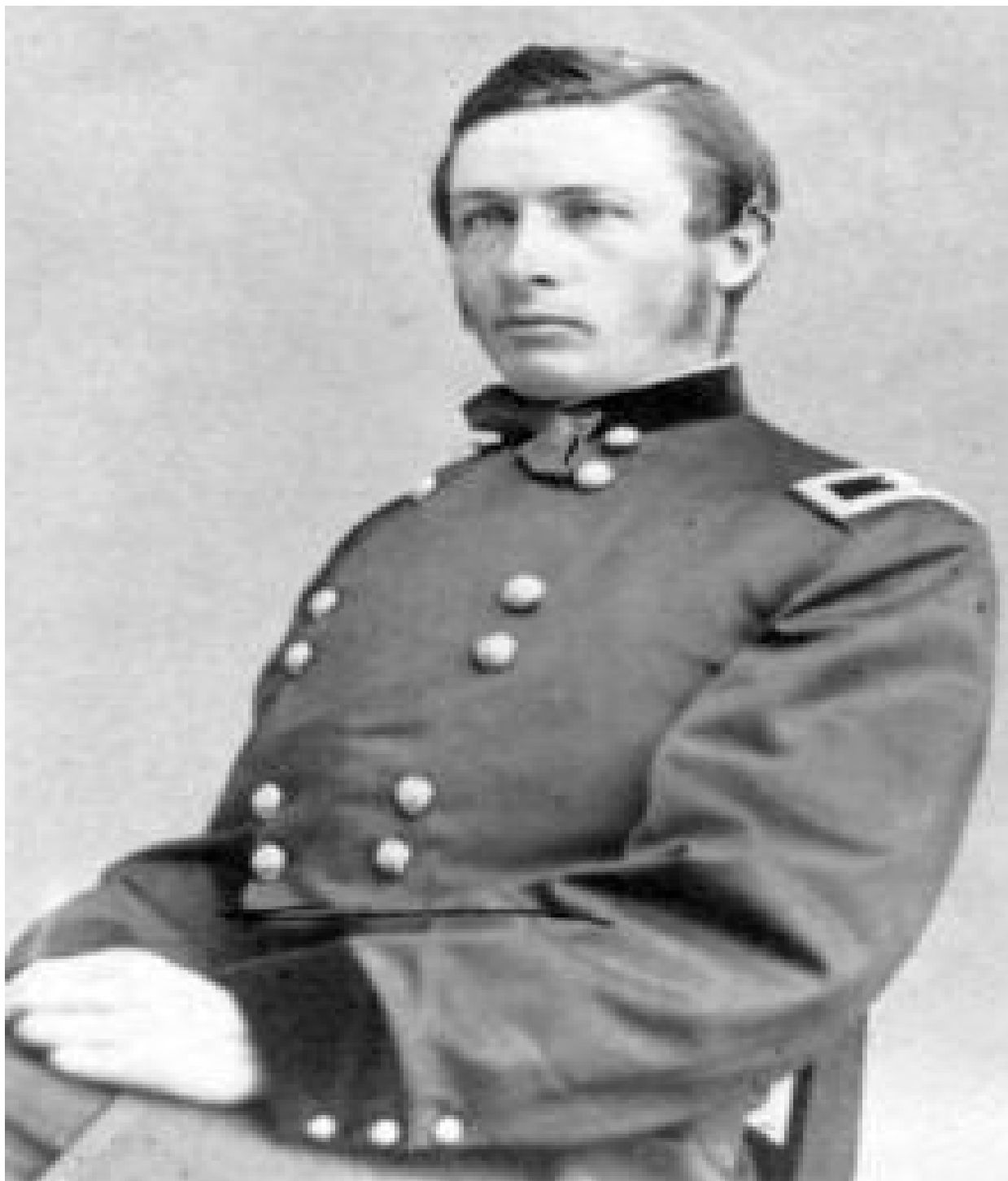
Colonel Ranald Slidell Mackenzie (pictured as a Brevet Brigadier General), circa 1864. 97