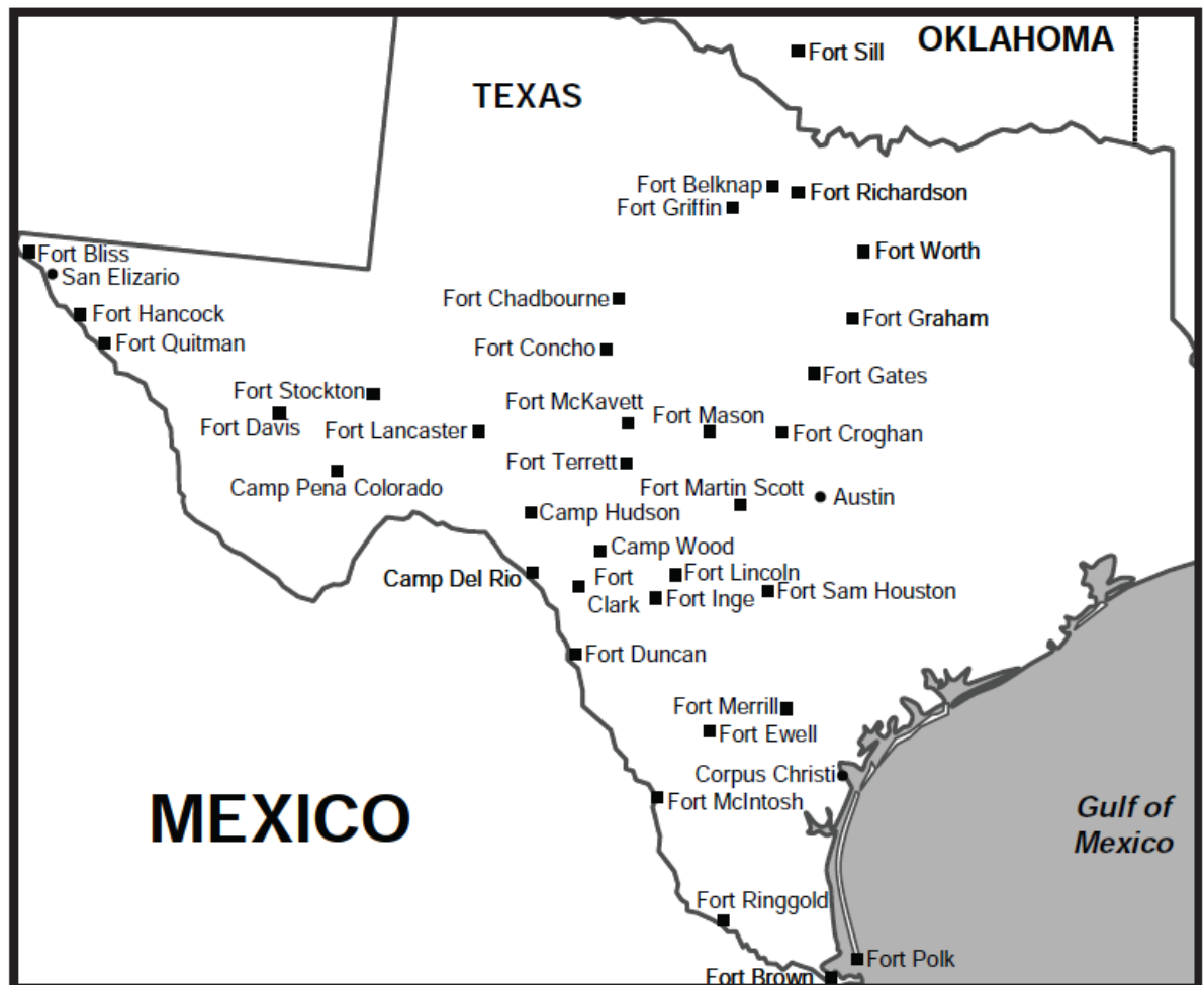
Figure 1. Forts in Texas [map].

new question arose: how to handle Indians who refused to move to, or stay on, reservations as they attacked settlements and communication lines? The U.S. Army was the only answer on the Texas frontier.