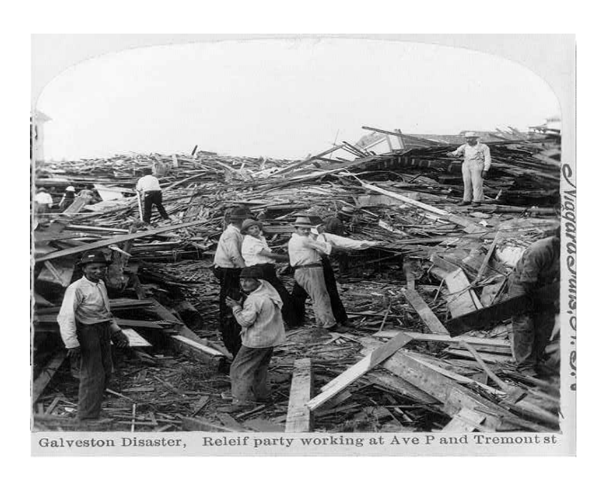
Figure 1. Picture of Galveston, Texas

On September 8, 1900, the deadliest hurricane on record devastated the city of Galveston, Texas. Claiming between 8,000 and 12,000 lives, destroying roads, railways, and telegraphs, the hurricane left the survivors stranded until outside help could reach the city of rubble. Galveston lay below sea level and a large storm surge churned the city into a pile of broken lumber. Survivors struggled to remove the remnants of their lives from the devastation and piece them back together into a community. In the picture below, the catastrophic results of the hurricane are evident.