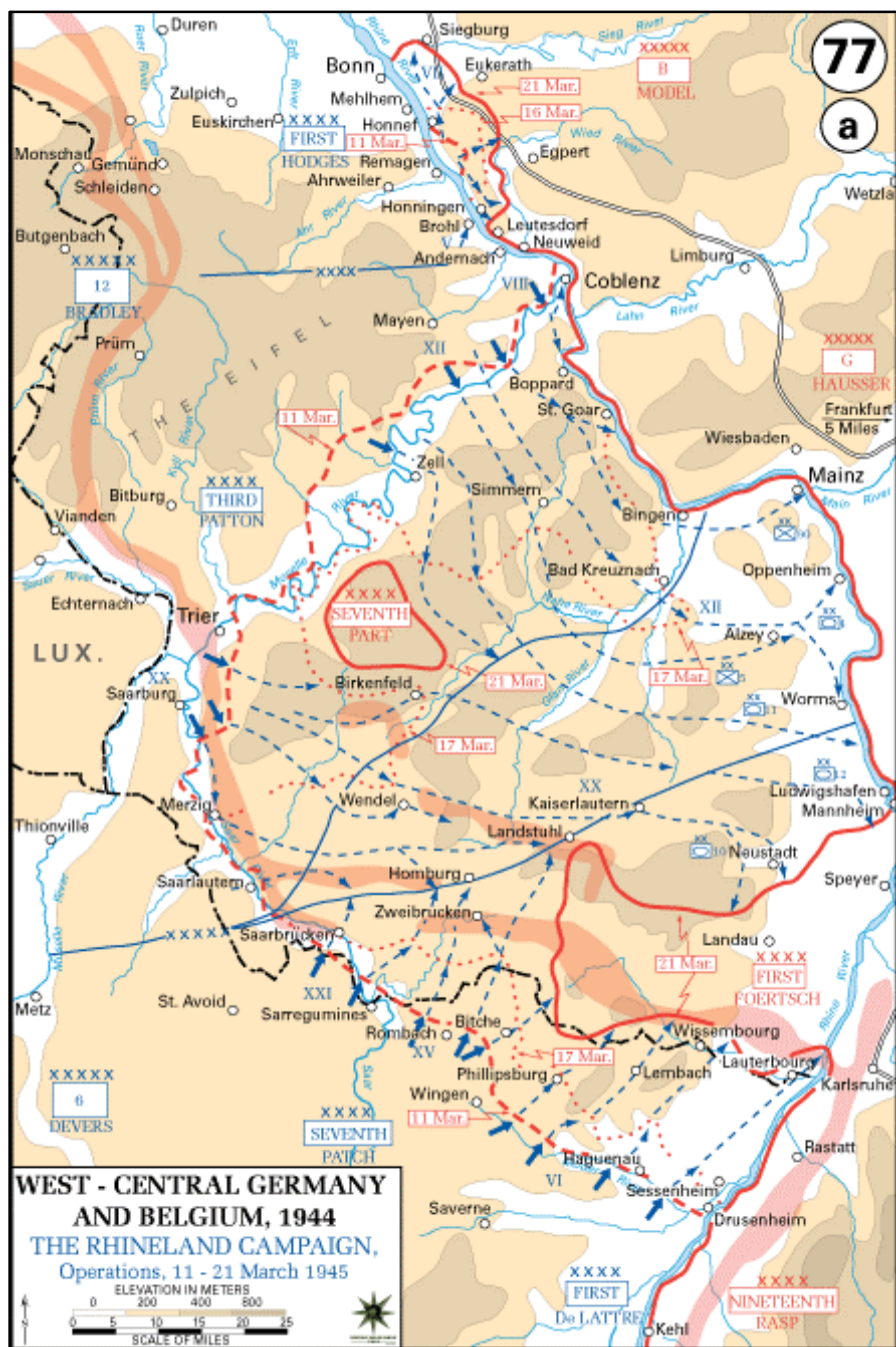
Figure 3: Operation Undertone