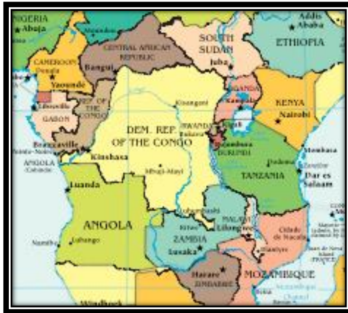
Figure 1. Democratic Republic of the Congo

The incredible complexity of the situation in the DRC and other conflicts around the globe forced the international community to weigh its options for military intervention in the Congo against equally violent situations elsewhere in the world, which meant that often the parties sought to achieve peace for the least cost.