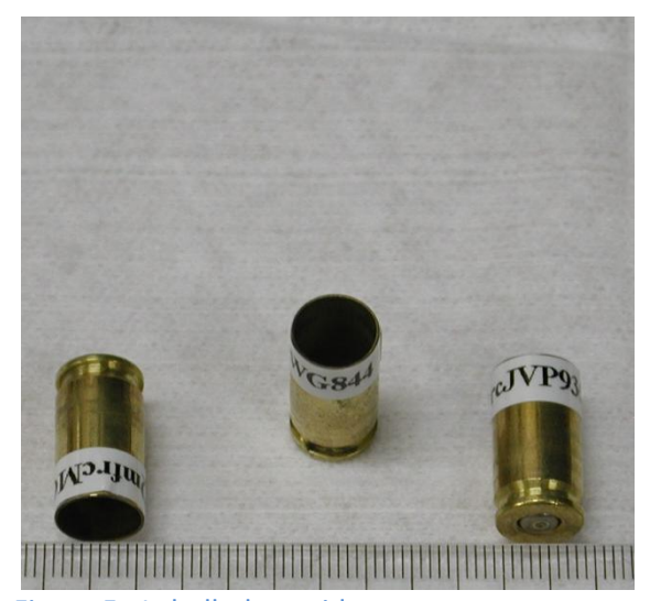
Figure 5. Labelled cartridge cases.

significantly smaller (with fewer samples to label, to assemble into sets, and check for accuracy in assembly), we would have considered different placement options.