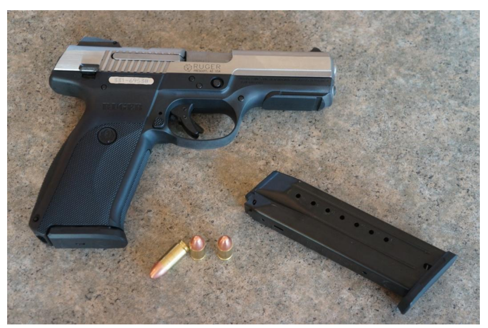
Figure 2: A Ruger© SR9© handgun with two 17-round magazines. This is the same model as the firearms used in this study.

received completed results from 218 respondents by the end of December, 2013. Answers and identities, including significant identifying information like home organization, have been completely separated. However, from our respondent pool we can determine that 56% of those enrolled were employed by domestic state-level agencies, 30% were employed by domestic local agencies, 7% were employed by international (non-U.S.) agencies, 3% were employed by domestic federal agencies, and 3% were self-employed or worked for private forensic agencies.