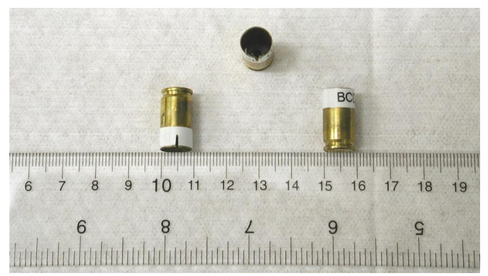
Figure 7. Sample cartridge cases intentionally altered for shipment to international participants.