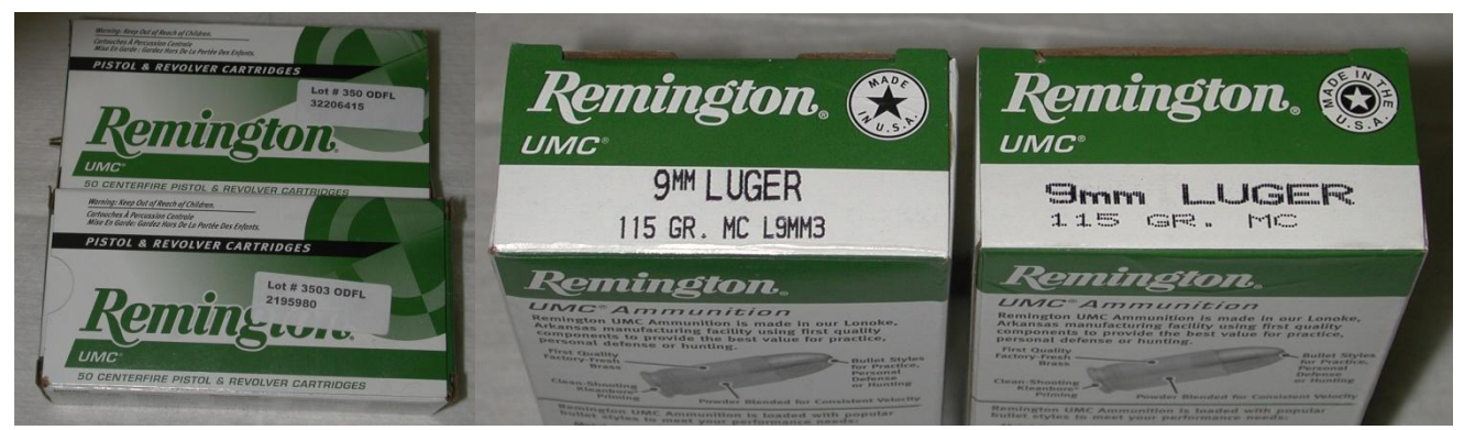
Figure 3. Boxes containing ammunition used in this study.

The ammunition was divided up into batches of 16 boxes, which correspond to 800 cartridges per batch. Each batch was allotted to one of the 25 Ruger SR9 handguns. Except for handgun "B1," each handgun was used to fire all 800 cartridges of ammunition from the same Lot. Handgun "B1" was used to fire 400 cartridges of ammunition from each of the two lots.