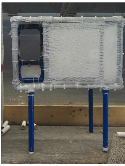
Figure 4. Brass catcher used to collect samples for this study.

The ammunition was fired and collected sequentially (i.e., 1-100, 101-200... 701-800). Only cartridge cases caught by the catcher were collected. If a cartridge case somehow fell out of the catcher, it was immediately discarded. Misfires were cleared from the firearm and disposed of without attempting to reuse the round. The 100-round ammunition carrier boxes were labeled with the firearm letter designation and the segment of cartridges that were collected (e.g., "Gun C2, 501-600").