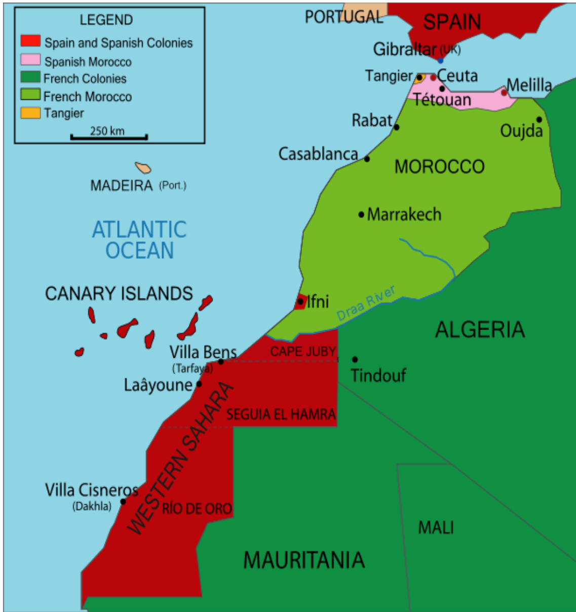
Figure 3. Map of the division of colonized Morocco between Spain and France