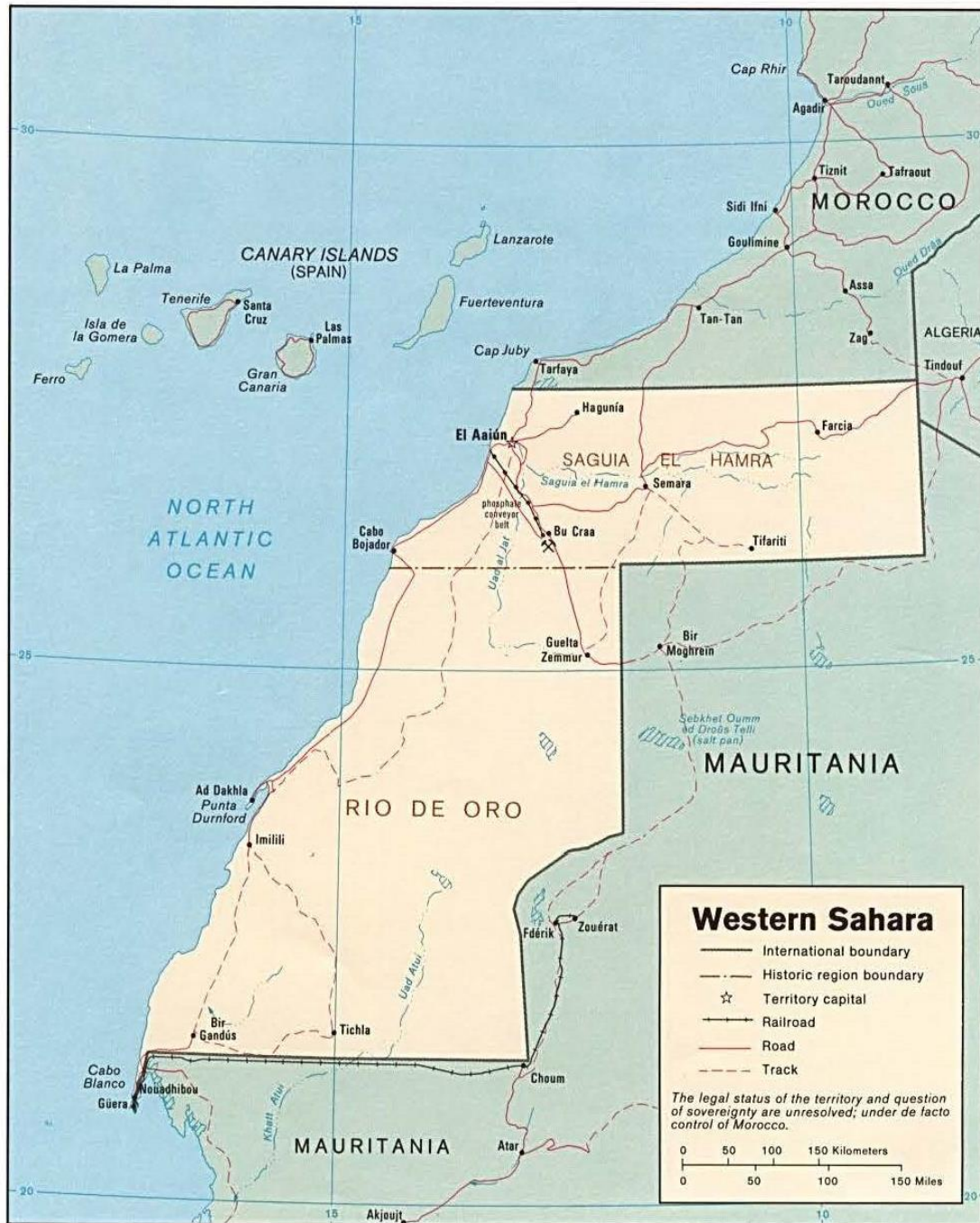
Figure 1. Map of Western Sahara