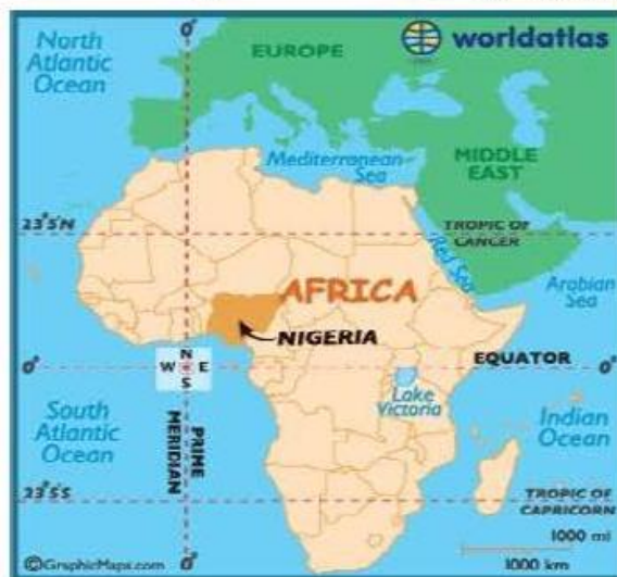
Figure 1. Map of Nigeria and its location in Africa

Source: Total Facts about Nigeria, “Physical Map of Nigeria,” http://www.total-facts-about-nigeria.com/physical-map-of-nigeria.html (accessed April 28, 2014).