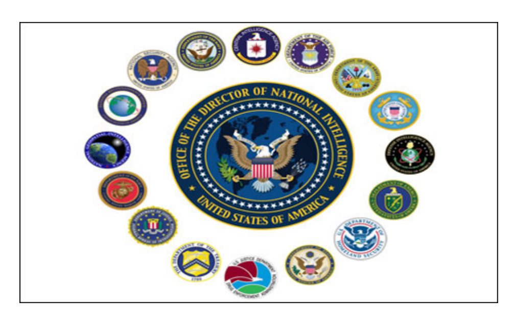
Figure 3. Logos of the Intelligence Community

Source: UNM National Security Studies Program, "The U.S. Intelligence Community," http://nssp.unm.edu/the-intelligence-community/index.html (accessed 16 March 2014).