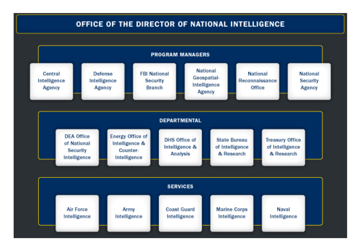
Figure 1. Intelligence Community Organizational Chart