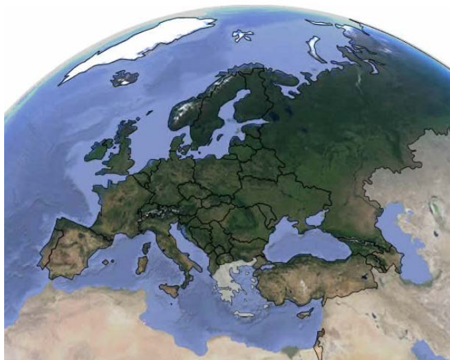
Figure 1. EUCOM Area of Responsibility