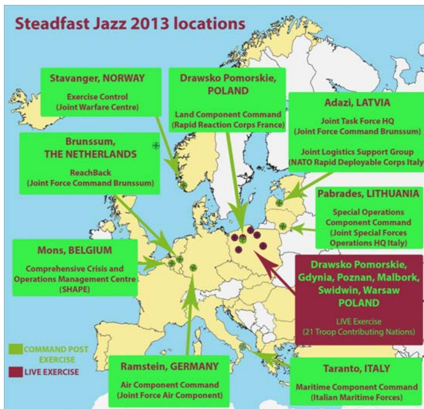
Figure 3. SFZ Exercise Locations Map