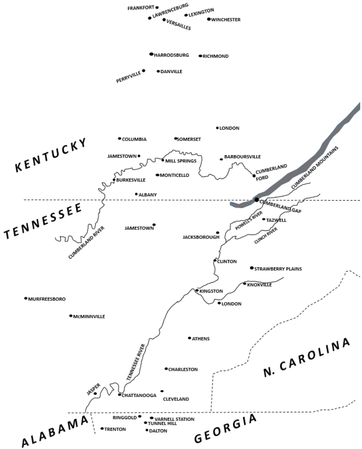
Figure 1. Kentucky, Tennessee, and North Georgia