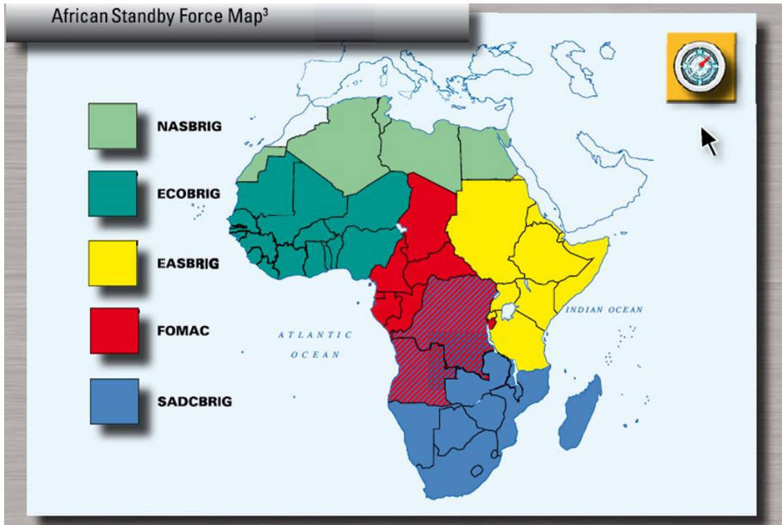
Figure 2. RECs Regional Mechanisms for Africa Standby Force

Source: African Union, Aide Memoire: The African Union’s Planning and Decision-Making Process, Version 4 Addis Ababa: African Union, 2 February 2010. http://eeas.europa.eu/csdp/capabilities/eu-support-african-capabilities/documents/aide_memoire_en.pdf (accessed March 19, 2014).