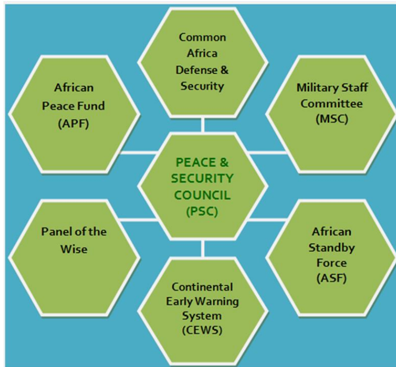
Figure 1. The Africa Peace and Security Architecture

The PSC Protocol requires that the RECs are part of its general security framework, even though the RECs are not directly controlled by the AU but have agreed to be affiliated with it. The protocol requires that all the RECs replicate the elements as indicated in the diagram below.