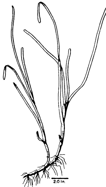
Figure. Vegetative Eelgrass

OBTAINING AND HANDLING PLANT MATERIAL: Plants should be obtained on the date of intended use. After digging, sprigs should be kept moist in a container covered with canvas or burlap and wetted with seawater. To plant, sprigs should be inserted into a